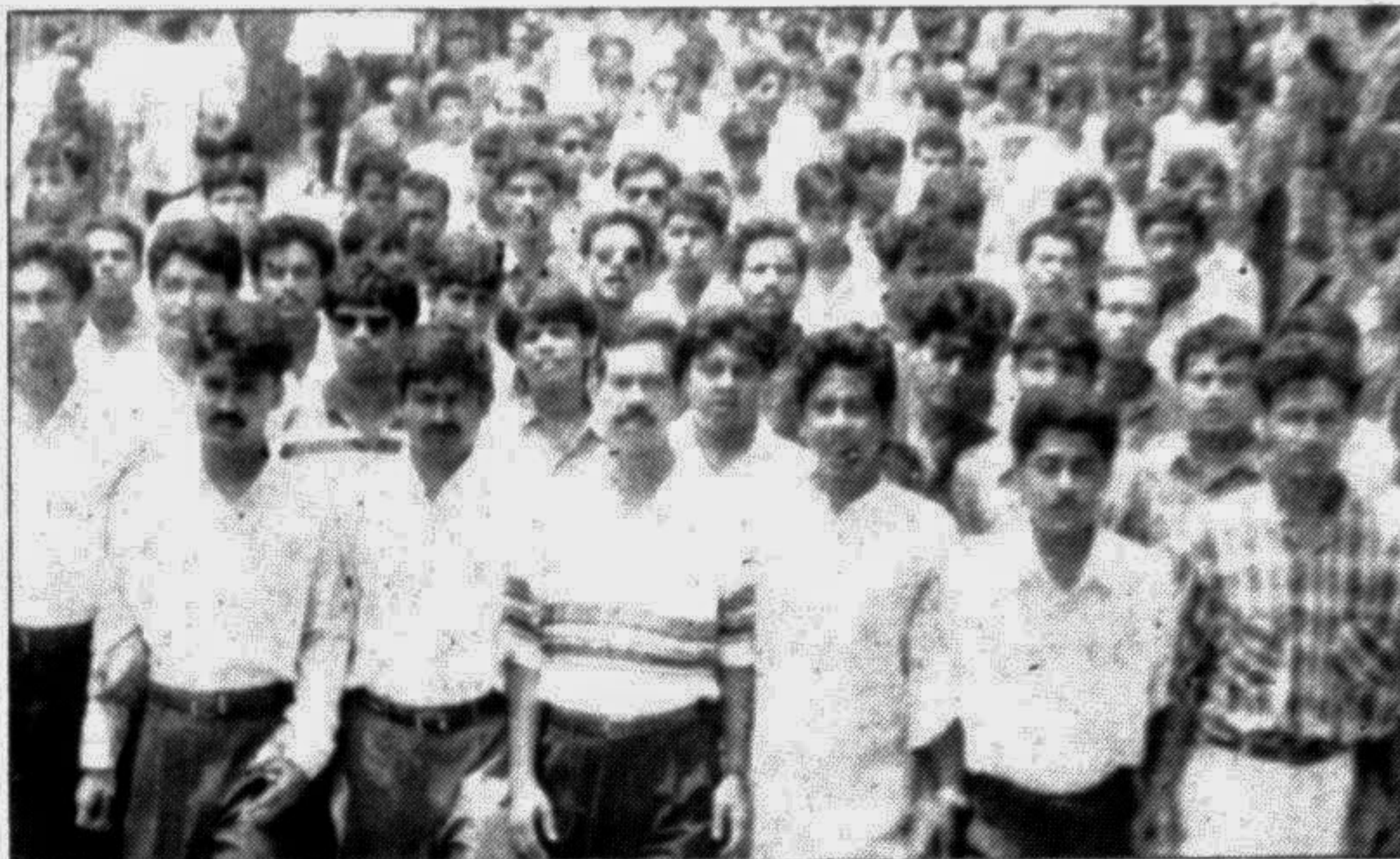
Jatiyatabadi Chhatra Dal, the student wing of the ruling party, brought out a procession on the Dhaka University campus yesterday demanding to make the campus free from violence.