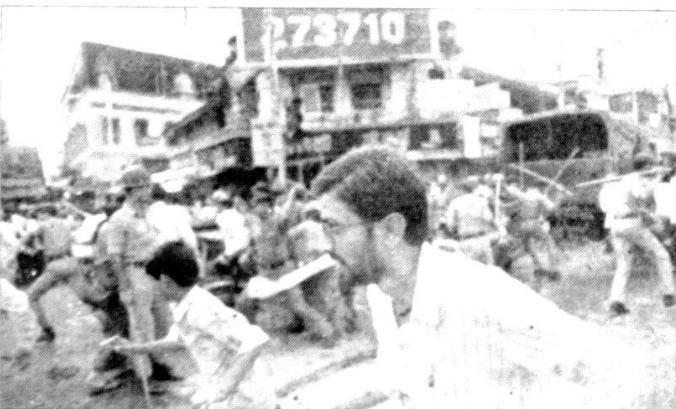
Activists of the Hindu nationalist Bharatiya Janata Party (BJP) flee baton-wielding police yesterday in the Andheri suburb of Bombay after the youths stoned buses during a one-day general strike called by the BJP to protest the assassination of its Bombay leader Ramdas Nayak Thursday.