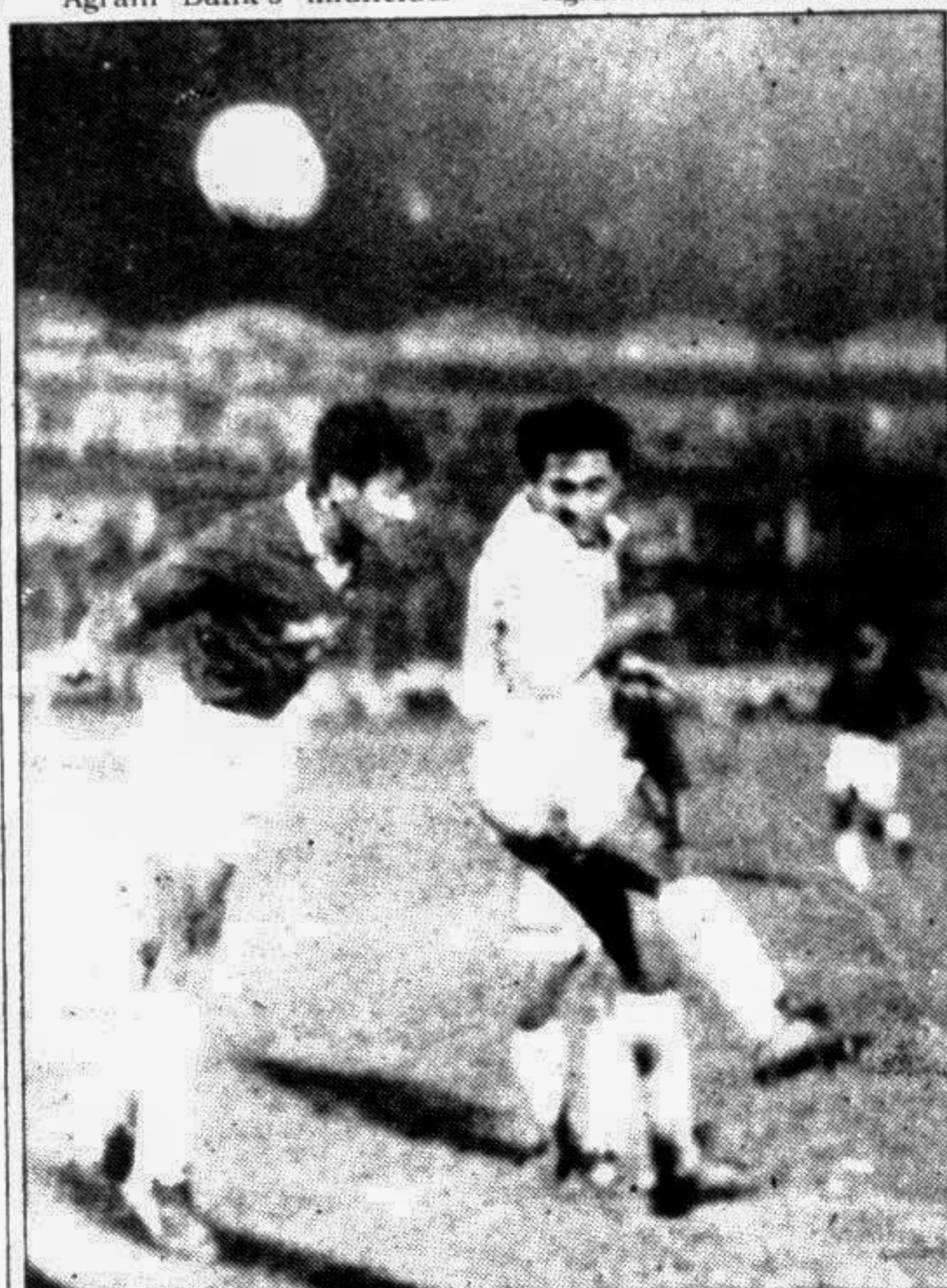
Action from last night's Star Premier Division football league encounter between Abahani Krira Chakra and Agrani Bank at the Dhaka Stadium. Abahani won the match 3-2.

Lowly, Agrani Bank bungled a genuine prospect of pulling off their second giant-killing act in a week as title aspirants Abahani Krira Chakra twice came back from behind to beat them 3-2 in a pulsating Star Premier Division football league encounter at the Dhaka Stadium last evening. Struggling to avoid relegation to Star First Division, Agrani Bank, who had handed strong Brothers Union their first defeat last Friday, yesterday twice shot into the lead in a goal-strewn first half that saw all the five goals scored in a heady exhibition of some positive, pacy soccer and shabby goalkeeping particularly by the Bank custodian. Abahani, who were recently caught in a whirlpool of draws, having shared points with the powerful Muktiyoddha Sangsad following yet another barren battle with an unfancied Public Works Department yesterday found themselves a goal down before settling down. Agrani Bank's midfielder