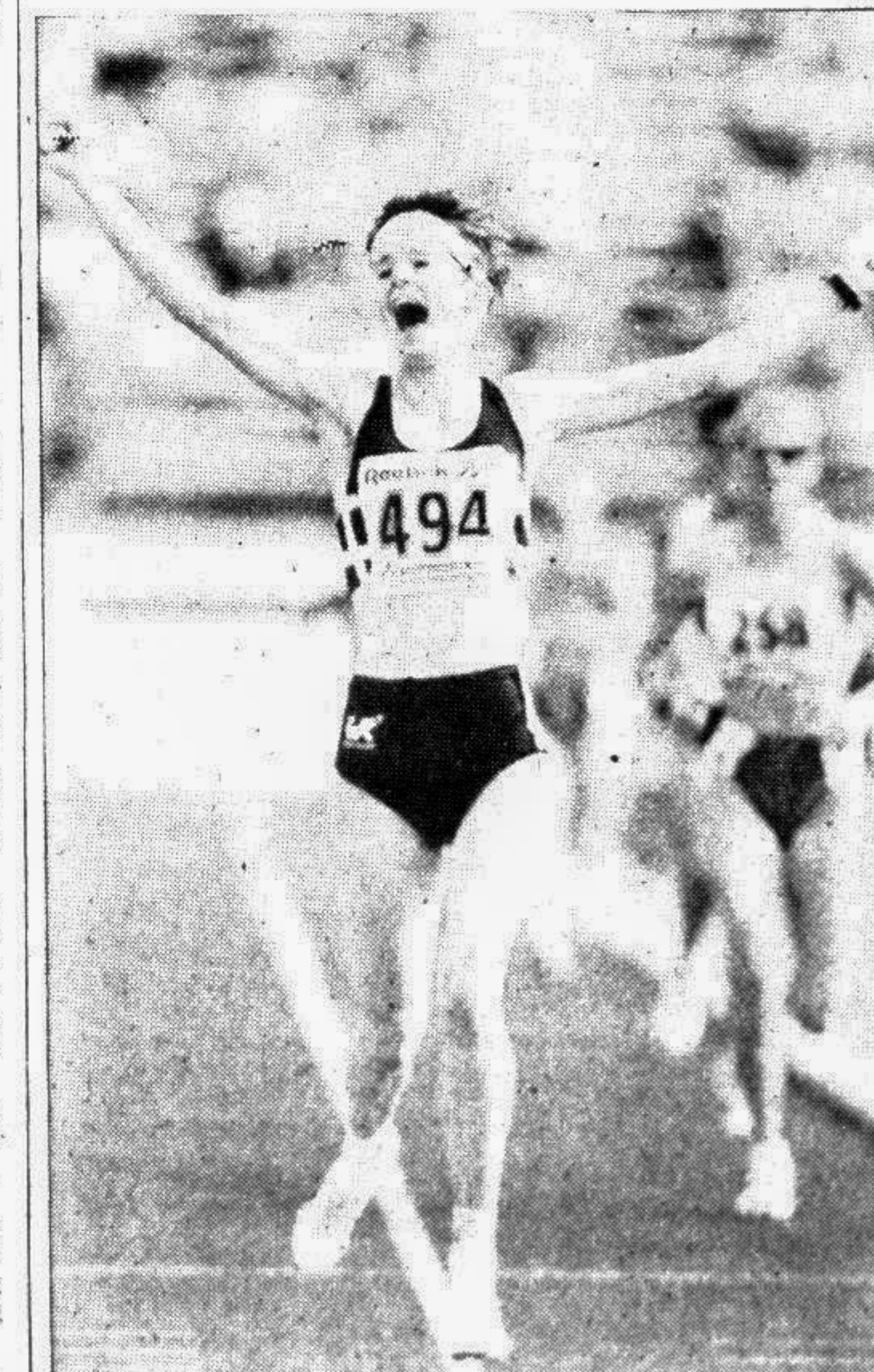
Yvonne Murray of Scotland celebrates after winning the women's 10,000 metres final at the Commonwealth Games in Victoria. Murray's time was 31:56.97.