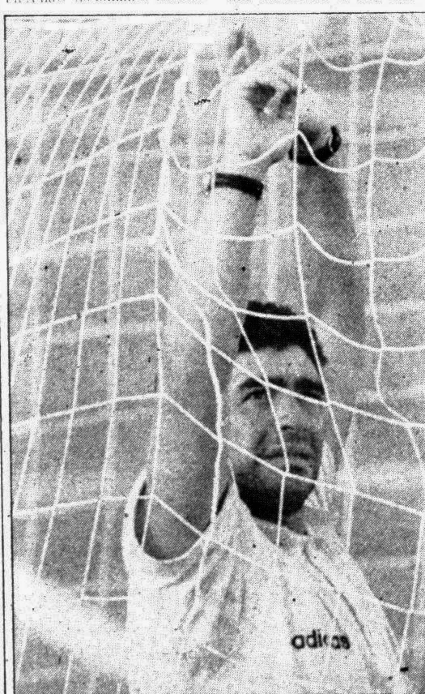
An AFP file photo dated June 29, 1994 shows disgraced Argentine soccer captain Diego Maradona in Dallas. Maradona was suspended from playing for 15 months by FIFA in Zurich on August 24 for his latest doping offence.