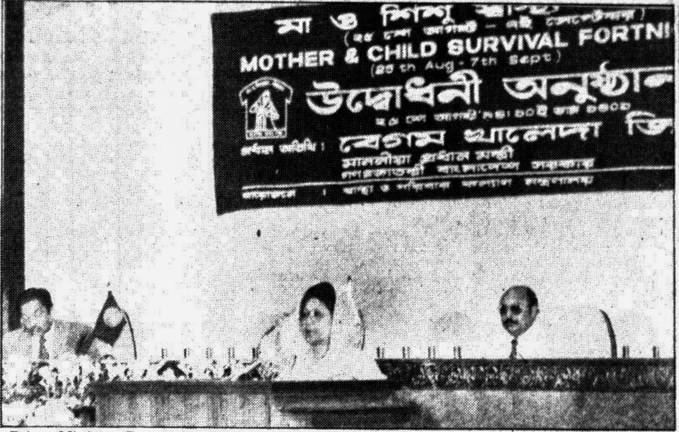
Prime Minister Begum Khaleda Zia inaugurating the Mother and Child Survival Fortnight '94 at the International Conference Centre in the city yesterday.

The similarity between a dog and a man is striking. Street dogs have the same territorial possessiveness as people. Just as each 'para' has its own 'mastaan' who controls the area with his special privilege of being the first to bully, loot or just throw his weight around, each corner of a neighbourhood has its own mastaan dog. Curiously, this creature may be a female and have all the qualities that a 'bitch' should have. She is as fierce as a wolf, constantly followed by obsequious males who are only too anxious to be the father of her children. She defends her territorial rights with a reign of terror, assisted by her loyal gang.