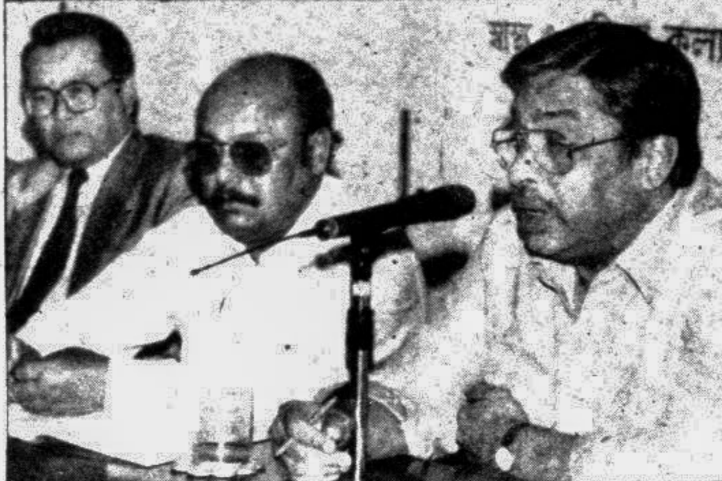
Health and Family Welfare Minister Chowdhury Kamal Ibne Yusuf (R) speaking at a press conference on the launching of the Mother and Child Health Fortnight '94 at the EPI conference room at Mahakhali in the city yesterday. Also seen are Deputy Minister for Health and Family Welfare Mohammad Sirajul Haq (C) and WHO Representative Wit Jak Sono.

Serajul Haque appreciated the role of the UNICEF, World Health Organisation (WHO) and the World Bank regarding observance of the fortnight.