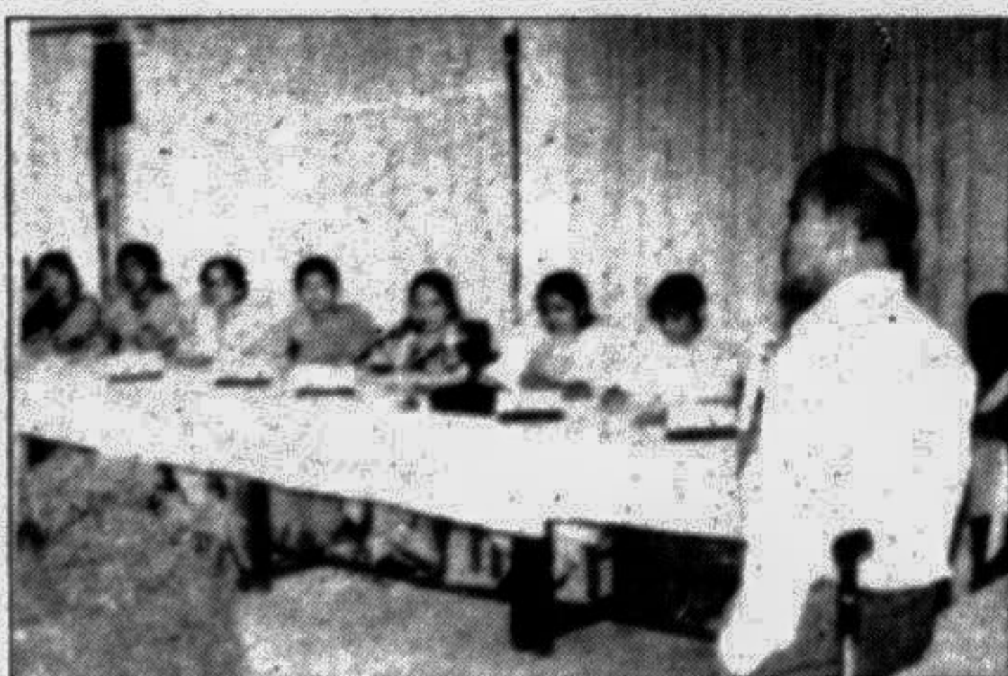
A fifteen-day training course for field organisers of Poverty Alleviation programme was inaugurated at the Bangladesh Rural Development Board training centre recently.

Earlier, about 2000 people became rootless in the affected areas as erosion continued for the last seven days.