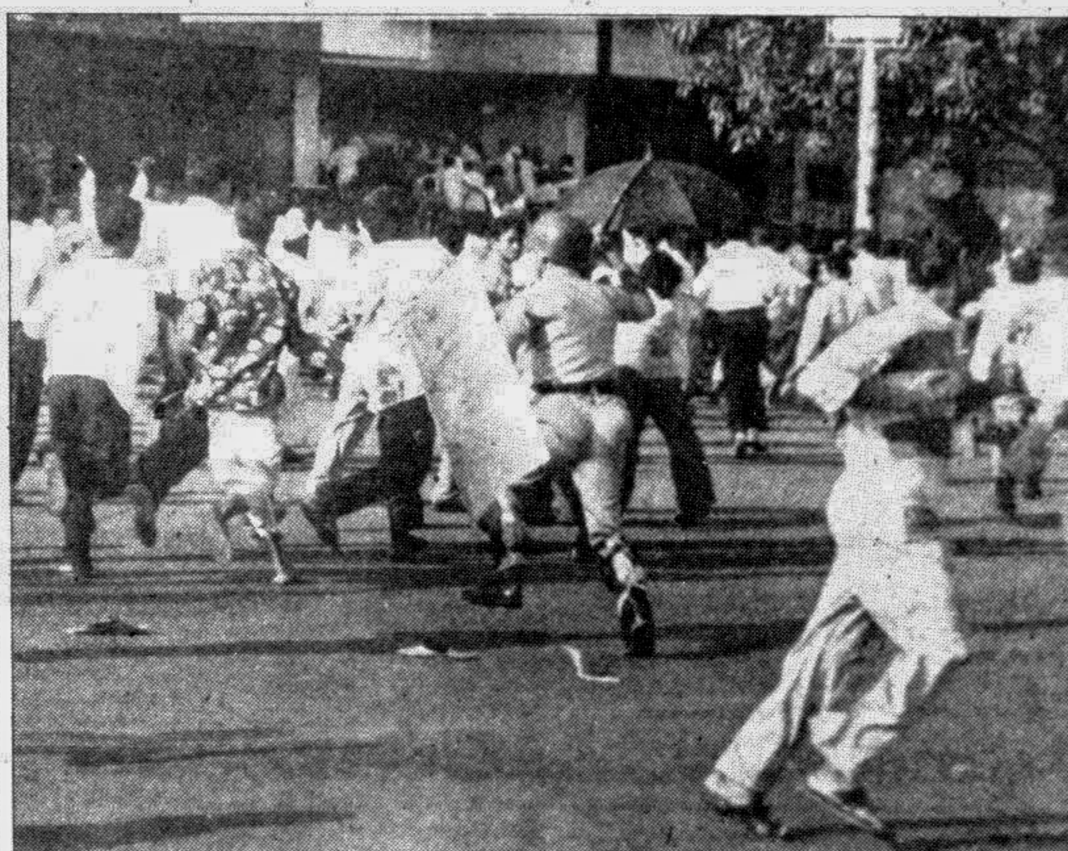
A policeman dispersing a Jatiya Party picket near the Panthapath in the city yesterday.

Communications Minister Col (Retd) Oli Ahmed, Special Envoy of the Prime Minister M Mofaied Khan, L K Siddiqi. See Page 12 Col 6