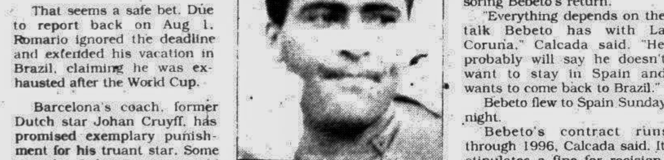
ROMARIO 'After I start to score a few goals, everything will be all right,' he said. Romario spent his last weekend in Brazil doing what he loves best: playing 'foot-volleyball' on the beaches of Barra da Tijuca, an upscale district south of Rio. He makes no secret that his heart lies in this city, where he was born in the Jacareinho slum 28 years ago. 'If there were a team in Brazil with conditions to buy me, I wouldn't even leave,' he said. But for now, no Brazilian club can meet Barcelona's asking price of $10 million. His homecoming may have to wait until Romario turns 30, when he becomes the owner of his contract. Meanwhile, local newspapers speculated that the speedy striker may be Italy-bound. The Rio daily O Dia reported that Romario met over the weekend with officials of Italy's Torino club. The meeting reportedly was to discuss a $10 million, three-year deal that would send Romario to Milan by way of Torino.

RIO, DE JANEIRO, Aug 22: Three weeks later, Romario returns to his Barcelona club on Monday to face the wrath of teammates, coach and fans. But it's nothing that a few goals can't fix, reports AP. The star of Brazil's World Cup champions team predicted a 'tumultuous' reception on his arrival. That seems a safe bet. Due to report back on Aug 1, Romario ignored the deadline and extended his vacation in Brazil, claiming he was exhausted after the World Cup. Barcelona's coach, former Dutch star Johan Cruyff, has promised exemplary punishment for his truant star. Some speculated that Romario could be 'demoted' to the club's Second-Division team. 'They say lots of things, but I probably will receive some kind of punishment,' Romario said in an interview published Monday in the Rio newspaper