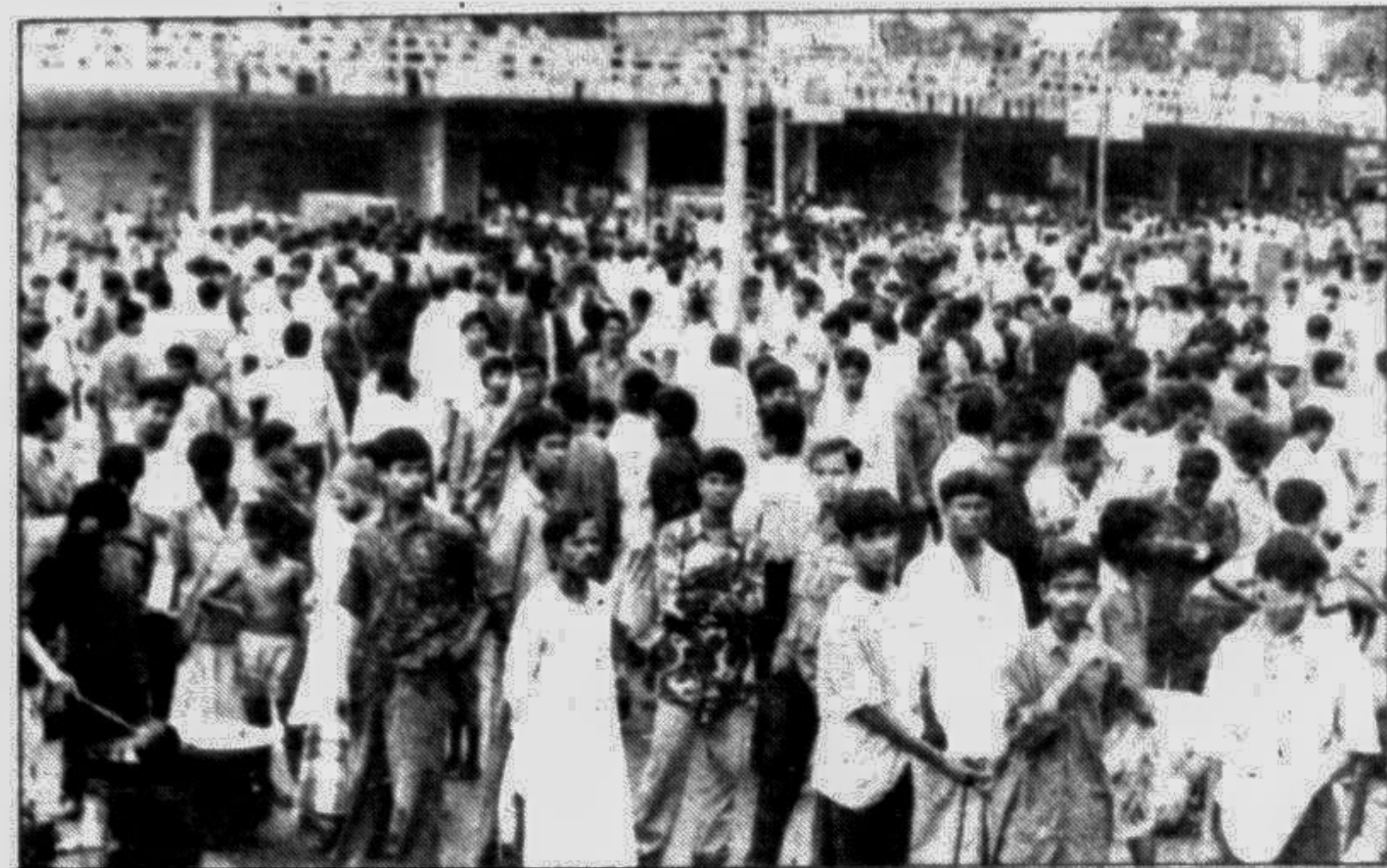
This conglomerate of agitating Mohammedan supporters and curious passersby ensured some action at the otherwise inactive Dhaka Stadium arena which was robbed of its usual share of life yesterday by the sudden cancellation of all Senior Division league matches for a day by the organisers DMFA. Although the DMFA attributed the reason to a piece of elder brotherly advice from the BFF, the fact of the matter was a hartal called by the football fans in the stadium arena. It looks like politics has future in football.