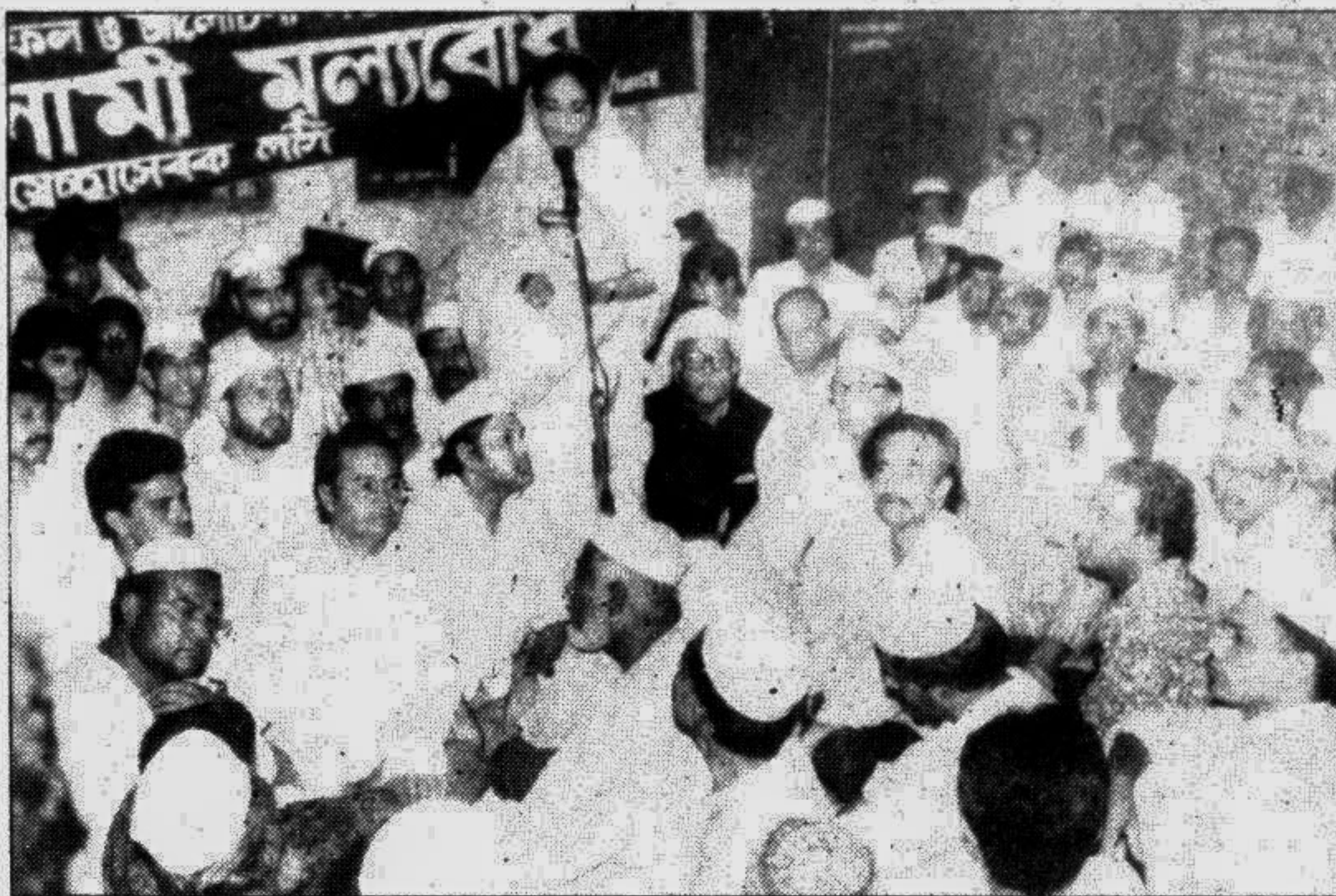
Awami League chief Sheikh Hasina speaking at a discussion on Islamic values and Bangabandhu' organised by the Awami Sechchasebak League at the party office in the city on Sunday.