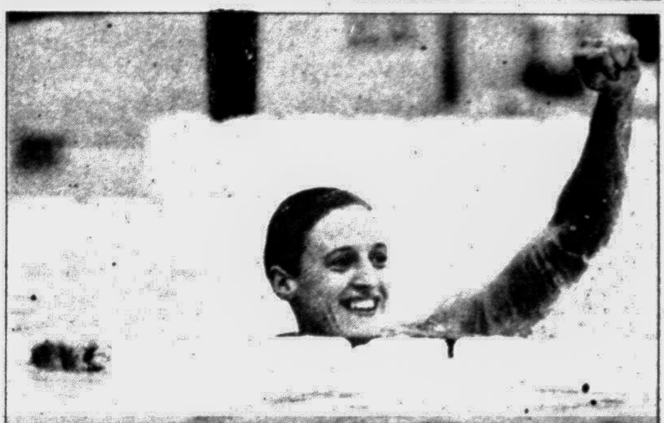
Britain's Karen Pickering celebrates after clinching the gold medal in the Women's 100 metres freestyle at the 15th Commonwealth Games in Victoria on August 19. Pickering set a new Games record clocking 56.20 seconds.

Built in 1930 to mark the centenary of Belgian Independence, the stadium boasts a fine art deco facade. Its crowd attendance record was set in 1956 when 75,000 watched Belgium play Hungary at soccer.