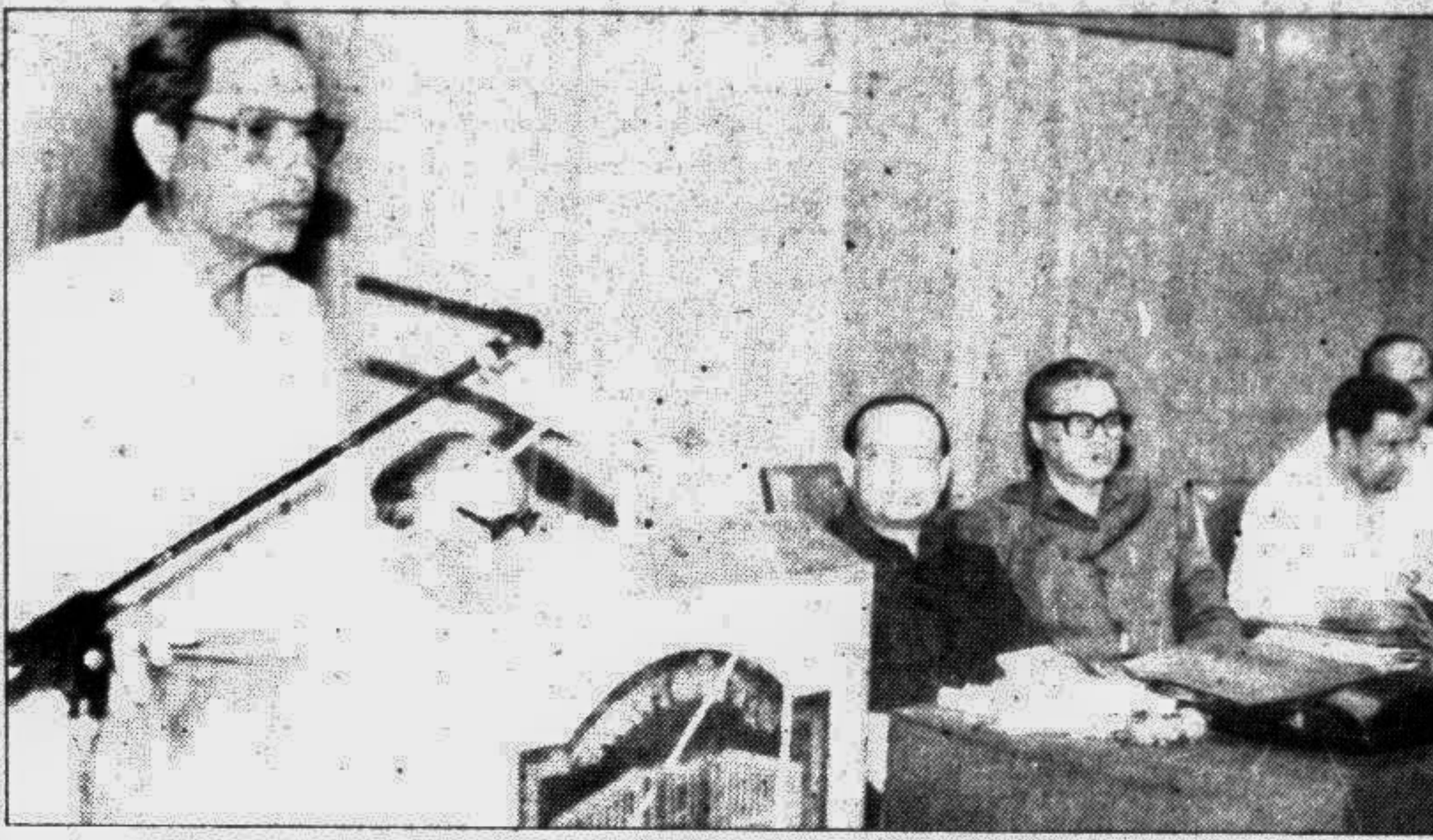
Deputy Leader of the Jatiya Sangsad Dr A Q M Badruddoza Chowdhury speaking at a freshers' reception of the Law Department, DU, organised by the Law Readers at the National Museum auditorium in the city yesterday.