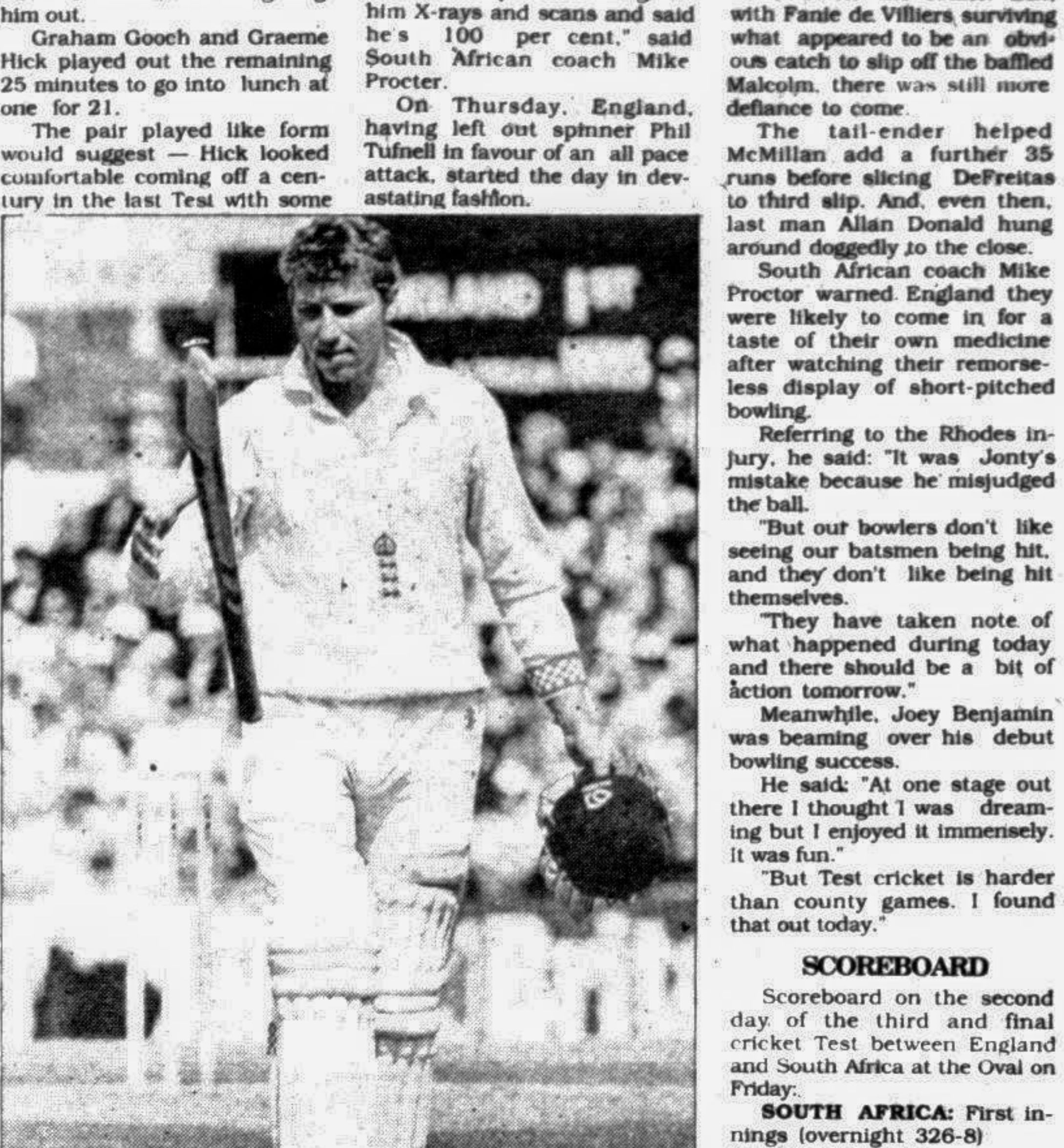
England skipper Michael Atherton tosses his bat in air to vent his frustration on the way back to the dressing room after being given out lbw to Fannie de Villiers for nought during England's first innings on the second day of the third and final Test against South Africa at the Oval yesterday. Atherton felt he nicked the ball on to his pad but obviously umpire Ken Palmer was not convinced.