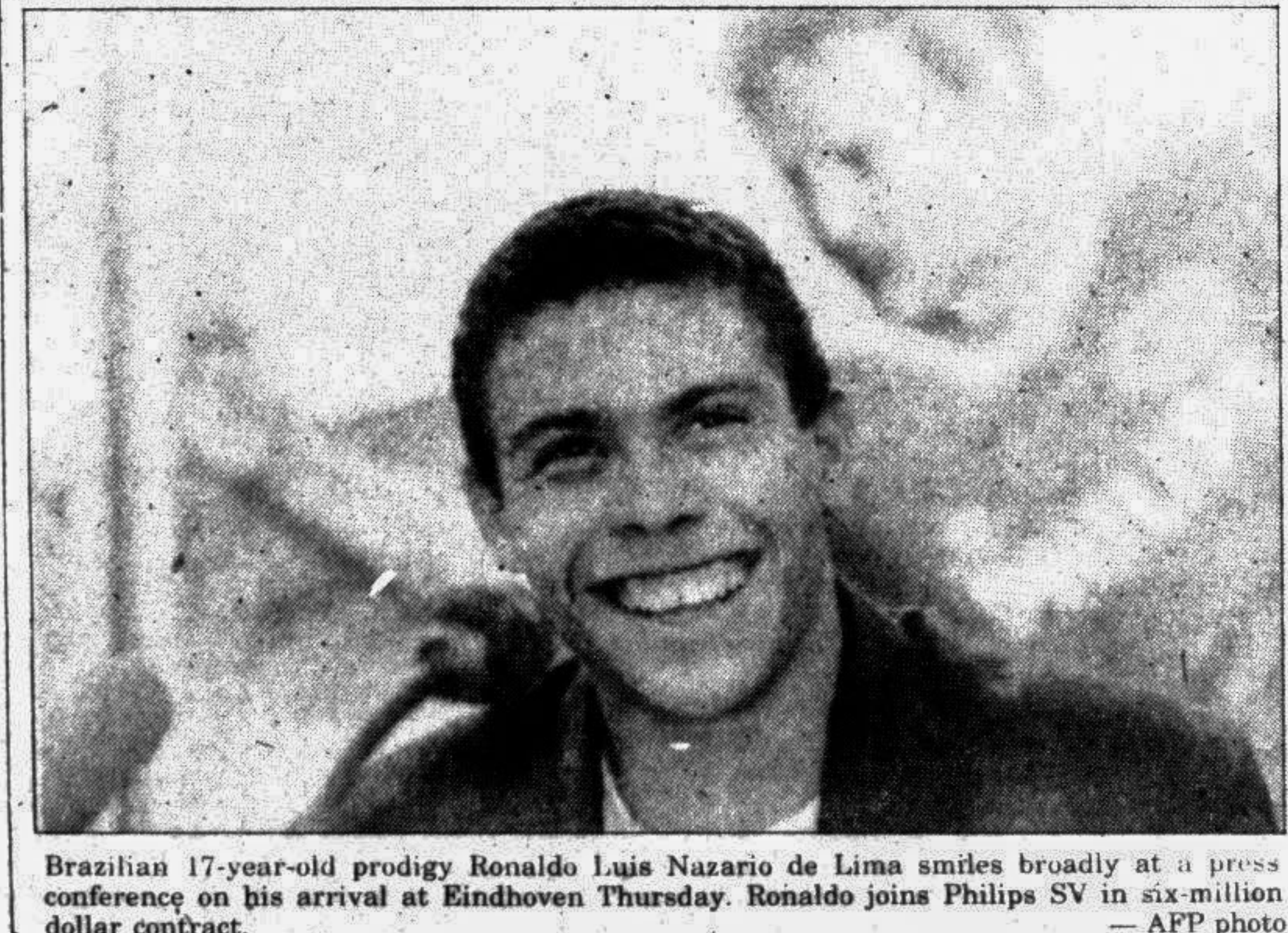
Brazilian 17-year-old prodigy Ronaldo Luis Nazario de Lima smiles broadly at a press conference on his arrival at Eindhoven Thursday. Ronaldo joins Philips SV in six-million dollar contract.