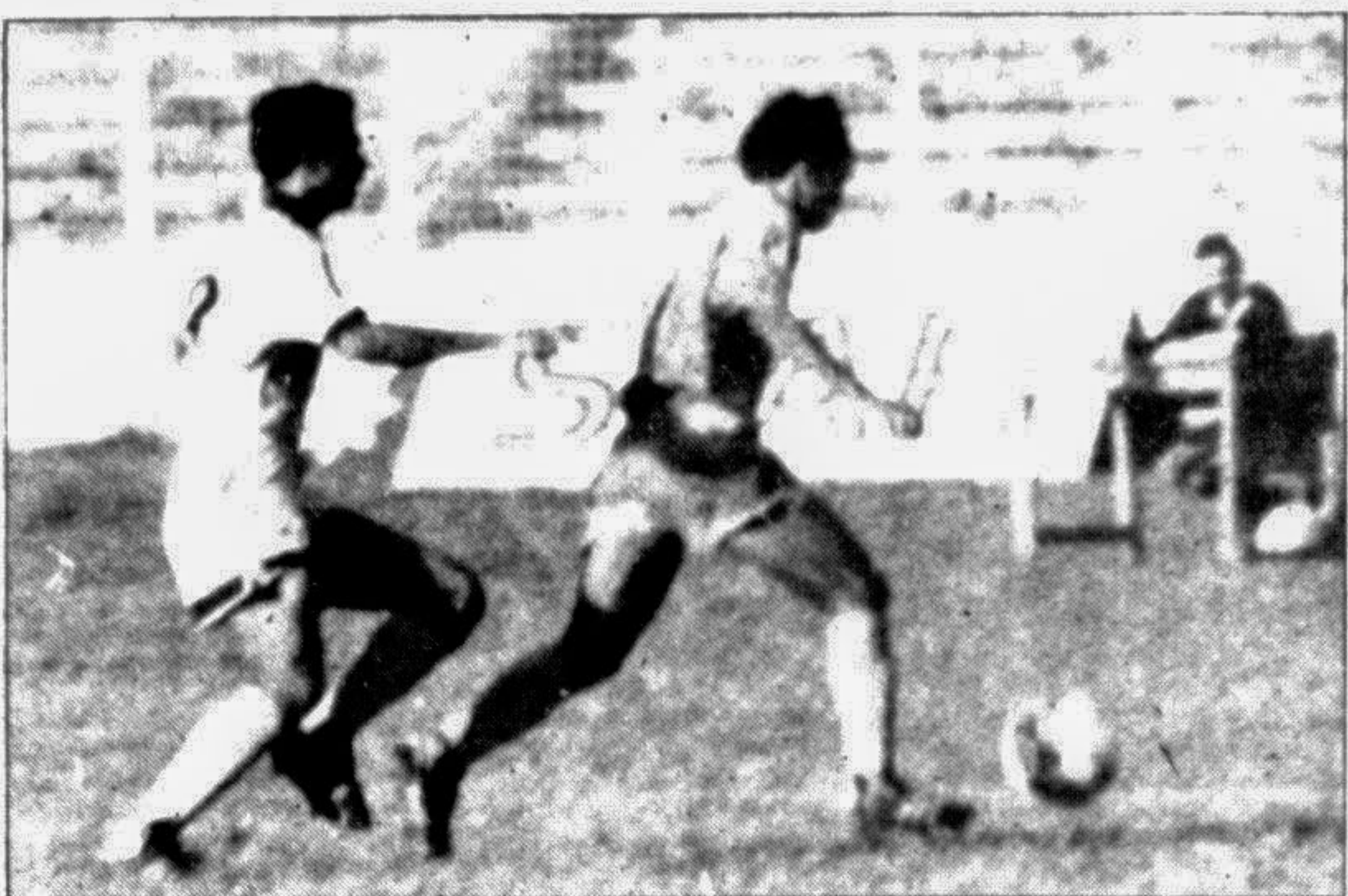
Action from yesterday's Star First Division football league match between Dhanmondi and Shantinagar at the Dhaka Stadium. Shantinagar edged past Dhanmondi by a solitary goal.