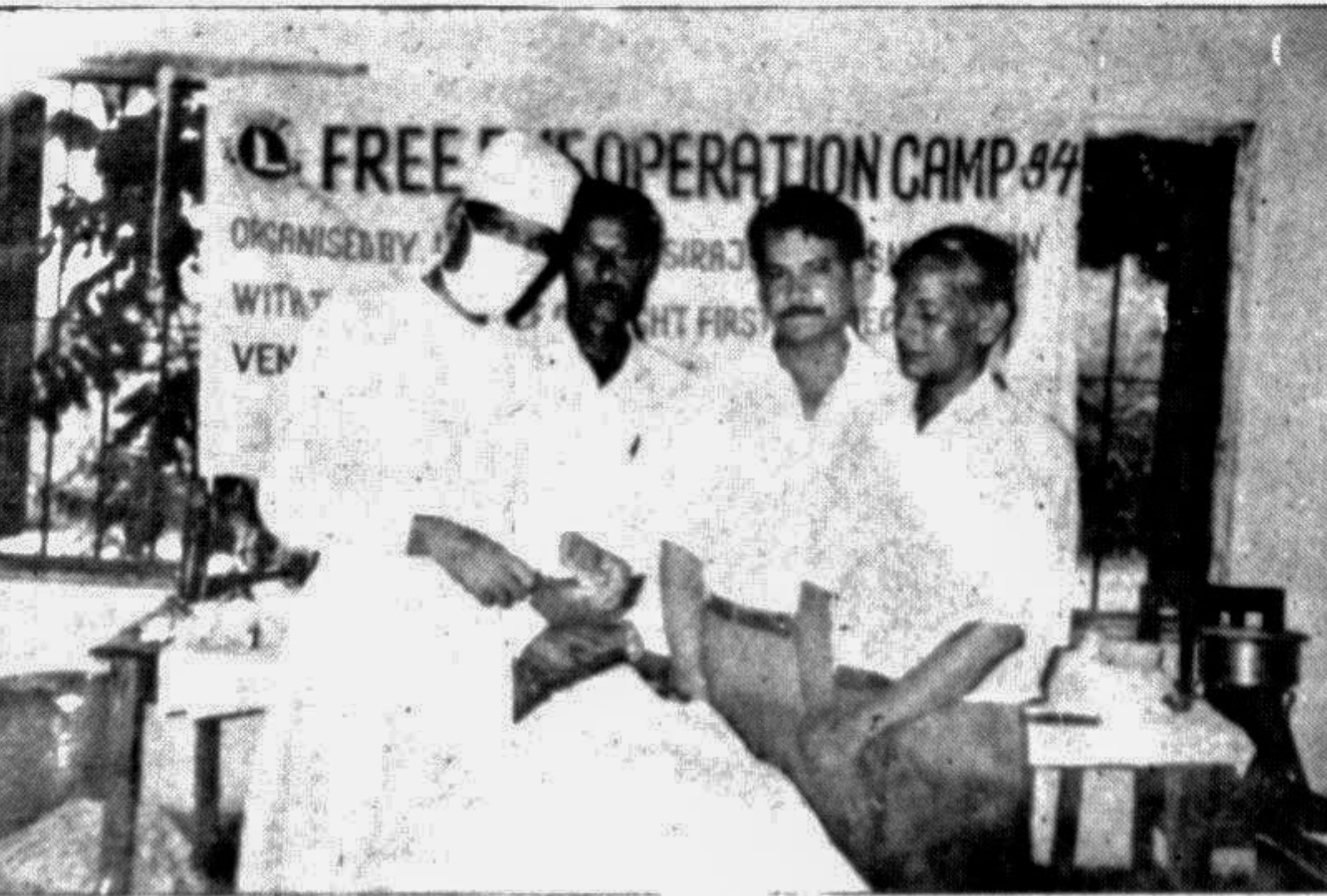
SIRAJGANJ: A cataract patient is being operated upon at Belkuchi eye camp.

Of the total land 123 acres of land has been distributed among the 574 landless people of Chuadanga sadar thana, 81 acres among 615 landless people of Alamdanga thana, 255 acres among 805 landless people of Damurhuda thana and 65 acres among 349 landless people of Jibannagar thana.