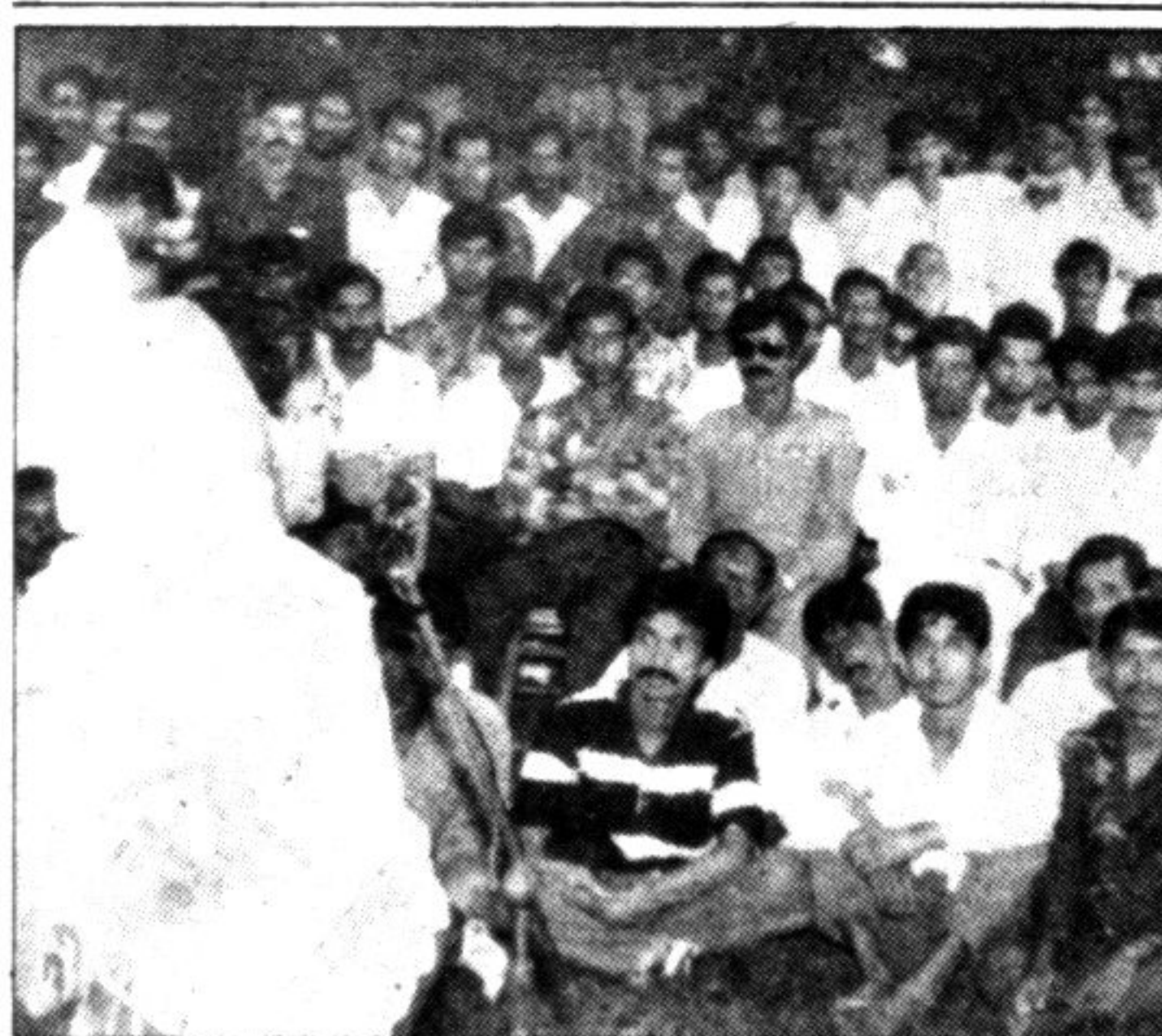
Awami League chief Sheikh Hasina addressing a group of leaders and workers of the undivided CPB who joined her party at her official Minto Road residence in the city yesterday.

Later, the Fisheries Minister visited the on-going fish fair arranged at the premises of the BARC.