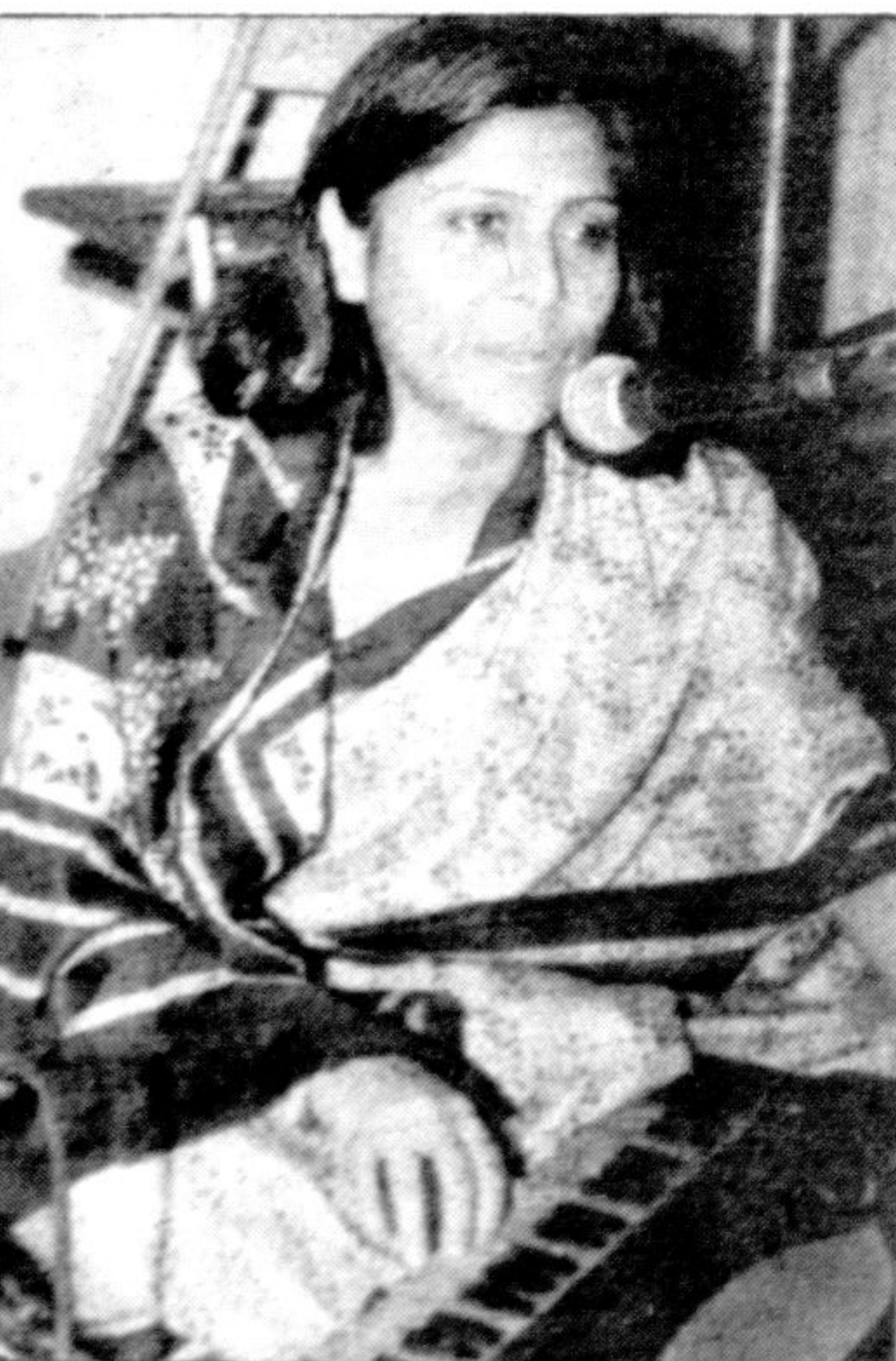
An artiste presenting songs at a cultural evening organised by the Happy Cultural Society, a new organisation of radio, TV and stage artistes, at the Russian Cultural Centre in the city yesterday.