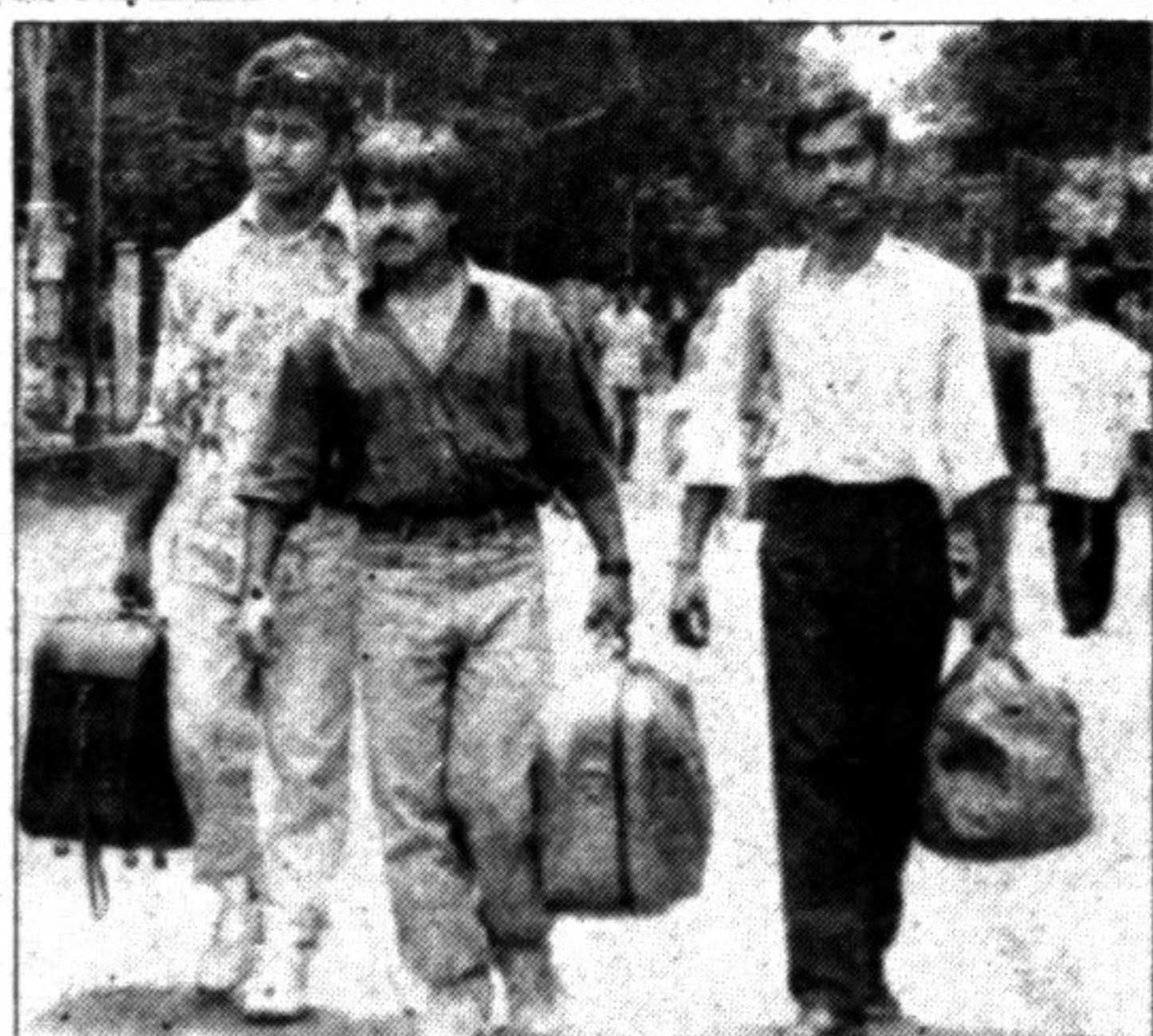
Three engineering students march out of their dormitory yesterday morning following the indefinite closure of the Bangladesh University of Engineering and Technology by the authorities on Wednesday.