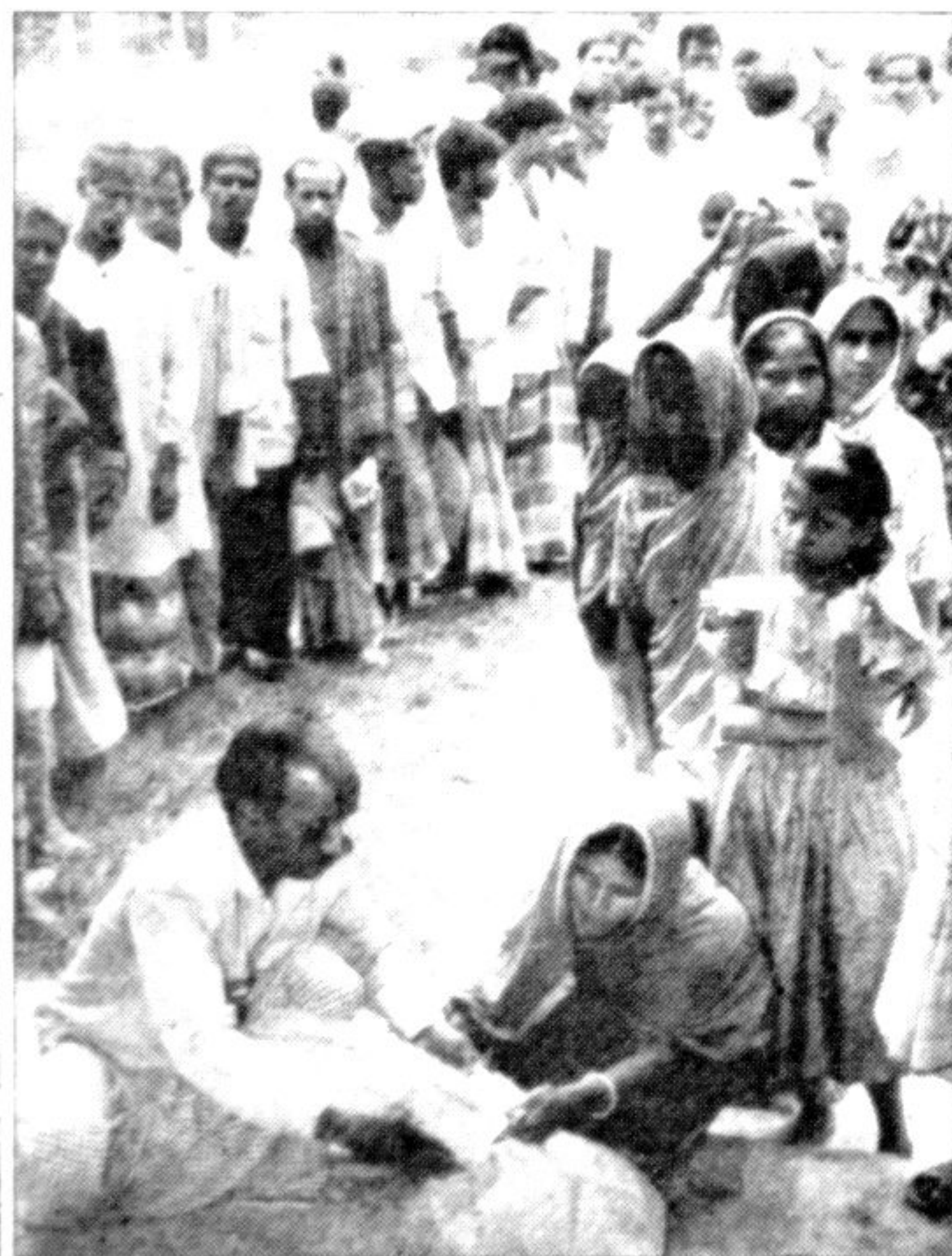
A large number of guardians queuing yesterday for wheat at a primary school in Gazipur covered by the government's Food-for-Education Programme for poor village children of school-going age.