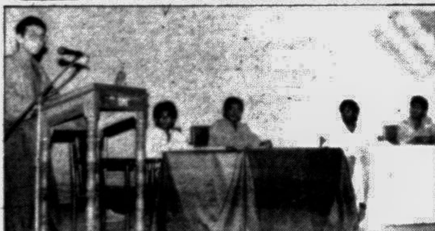
Participants at the opening day, yesterday, of a debate fair held at the Public Library auditorium in the city. The two-day fair is being held under the aegis of the Association of Debate Professionals (ADP).