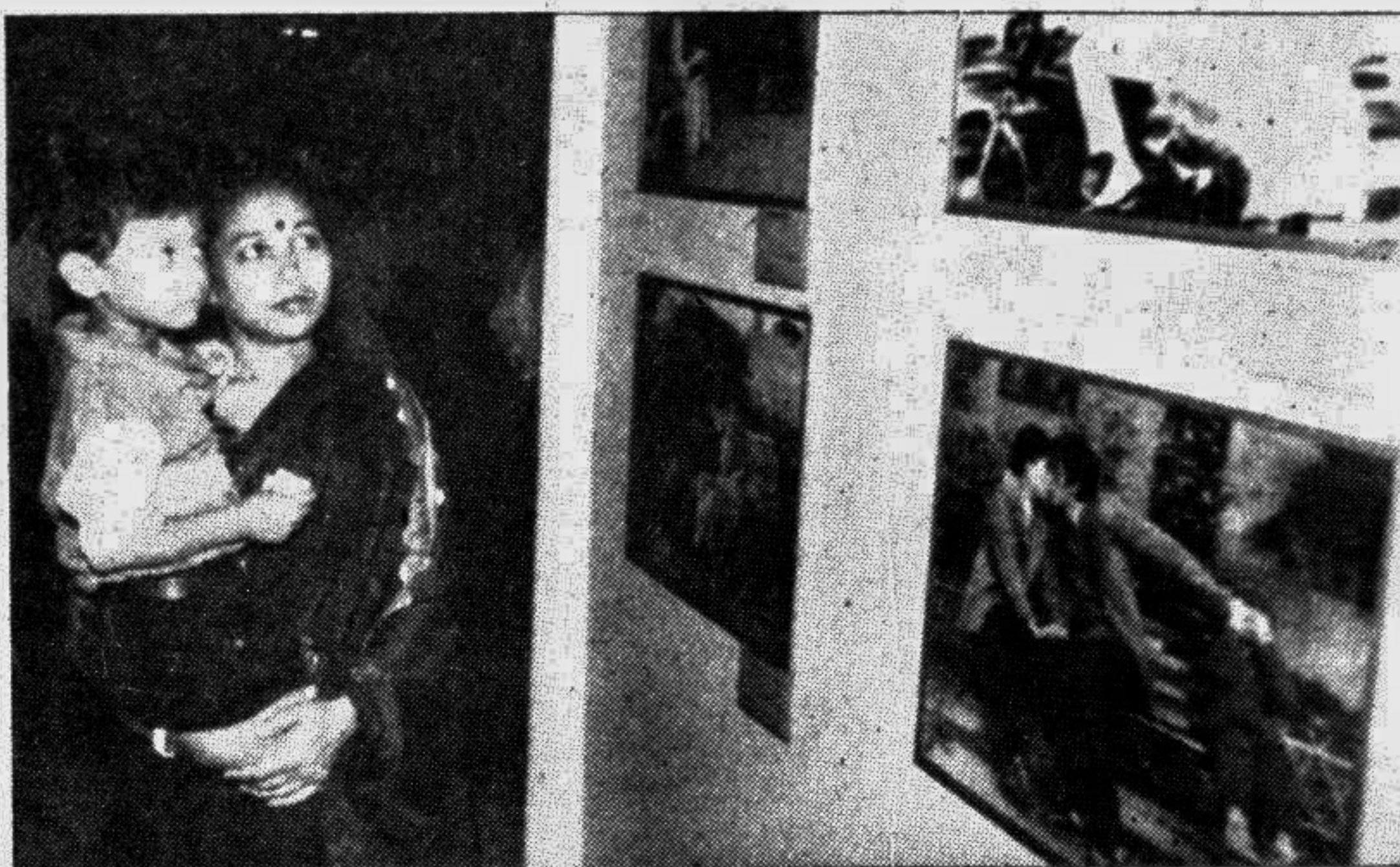
A visitor with a child at the opening day, yesterday, of the week-long mobile photo show entitled 'family' at Shilpakala Academy gallery.

Despite the unpleasantness of pests in the city, and the fact that it is much more dirty than what it was say three decades back, it is better than some of the other cities of the subcontinent.