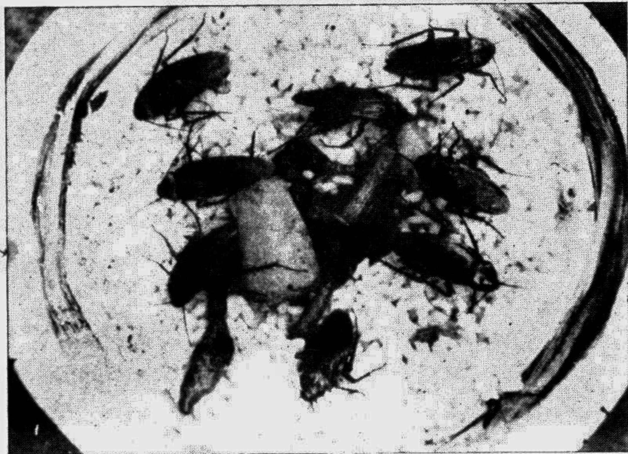
A different kind of invasion

"In summer life is intolerable in the kitchen