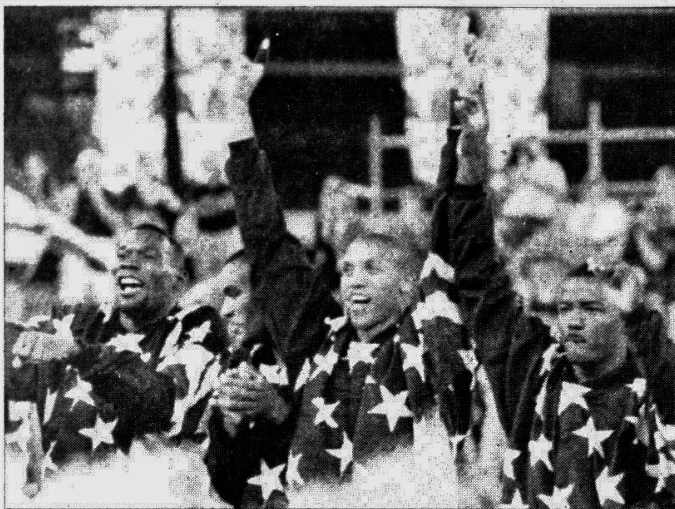
DREAM RUN OF A DREAM TEAM... (from left to right) Shawn Kemp, Reggie Miller and Joe Dumars acknowledges the crowd's applause during the ceremonial after beating the Russians 137-91 in the World Basketball Championship final in Toronto on August 14.