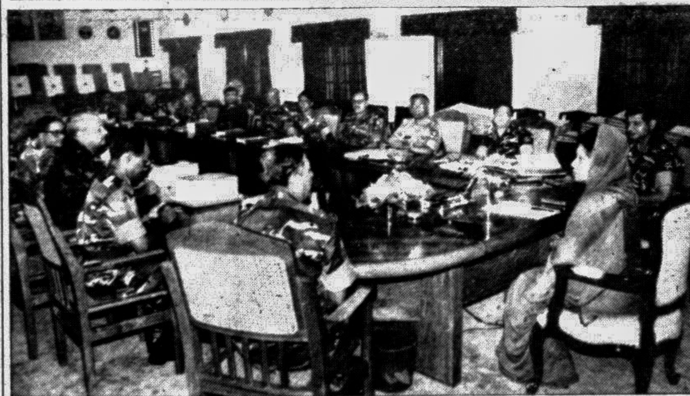
Prime Minister Begum Khaleda Zia at the annual meeting of the Army Selection Board at the Army Headquarters in the city, yesterday.

Earlier, on her arrival at the Army Headquarters the Prime Minister was received by the Chief of Army Staff and other senior military officials.