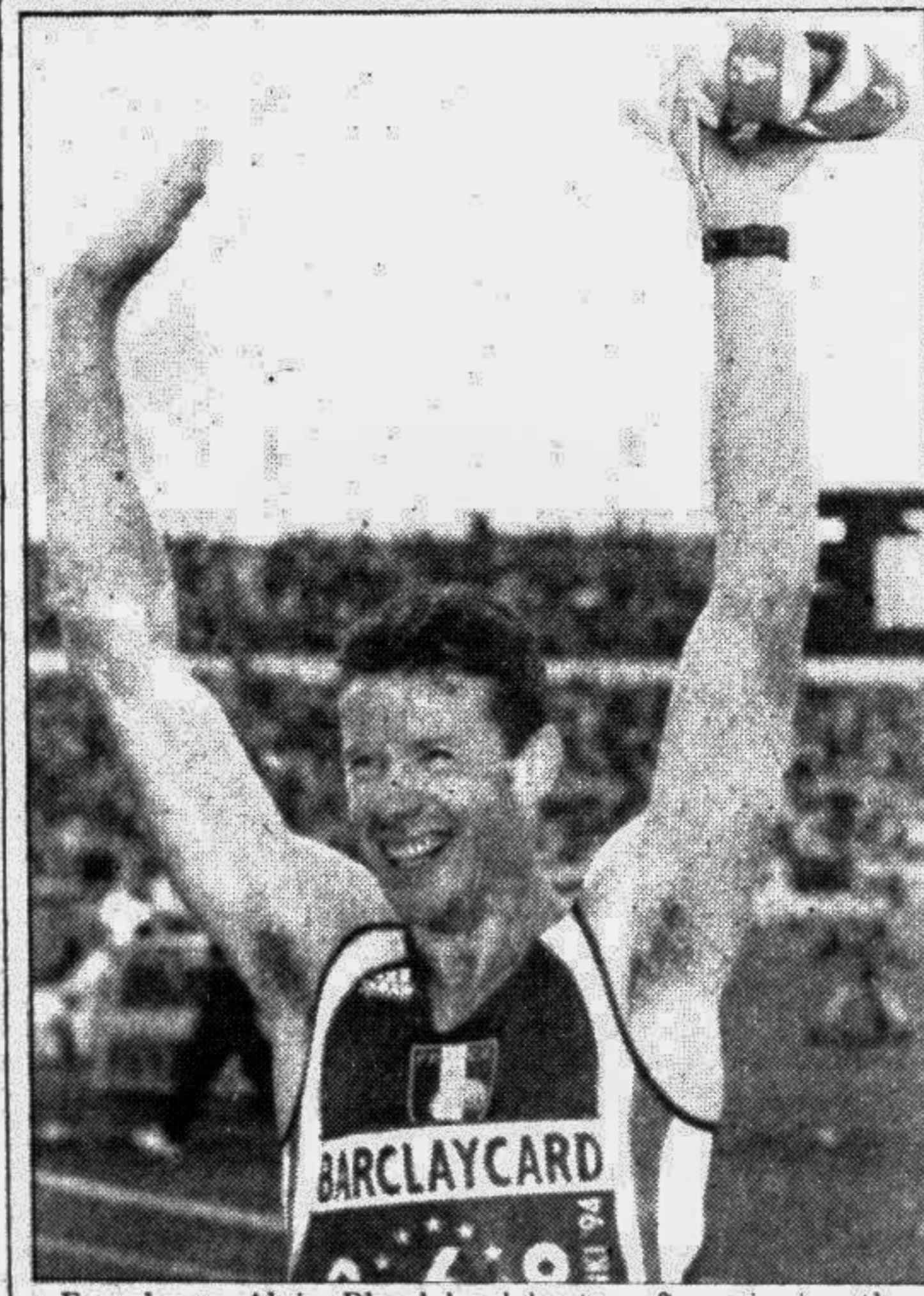
Frenchman Alain Blondel celebrates after winning the decathlon event of the European Athletics Championships in Helsinki on August 13. He collected 8,453 points.

"I was very, very lucky to escape the 5-1 lead he had in the tiebreaker," Edberg said. "I won some great points then and got excited. I was pumped up and it brought out my best tennis."