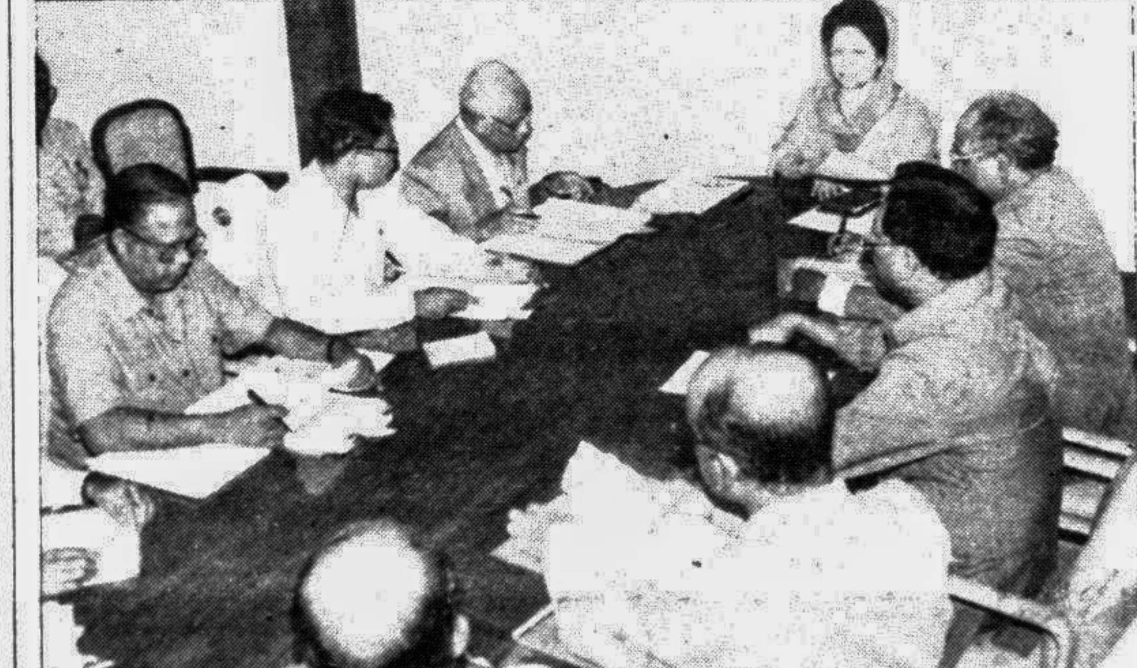
Prime Minister Begum Khaleda Zia presiding over a special meeting on the drought situation in several northern districts of the country at her office yesterday.

Awami League President Sheikh Hasina yesterday criticised the government for delaying scrapping of the indemnity Ordinance to clear the way for the trial of the killers of Bangabandhu Sheikh Mujibur Rahman, reports UNB. 'It is a national demand that the Indemnity Ordinance be scrapped. But the role of the ruling party in this matter is unfortunate', she said in a statement on the eve of the 19th anniversary of the death of Bangabandhu. Hasina, the eldest of Mujib's two daughters, said the killers who openly boasted of the killing were not put on trial. On the contrary, they were rewarded by being inducted into the foreign service. See Page 12 Col 8