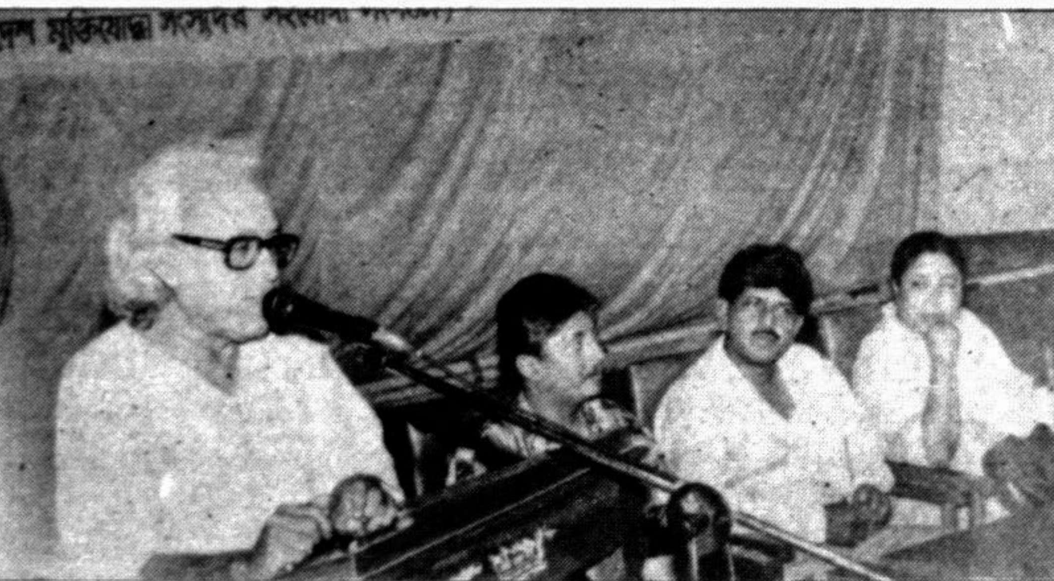
Poet Shamsur Rahman speaking at a seminar on the role of women in the war of liberation organised by the Muktiyoddha Mahila Command in the city yesterday.