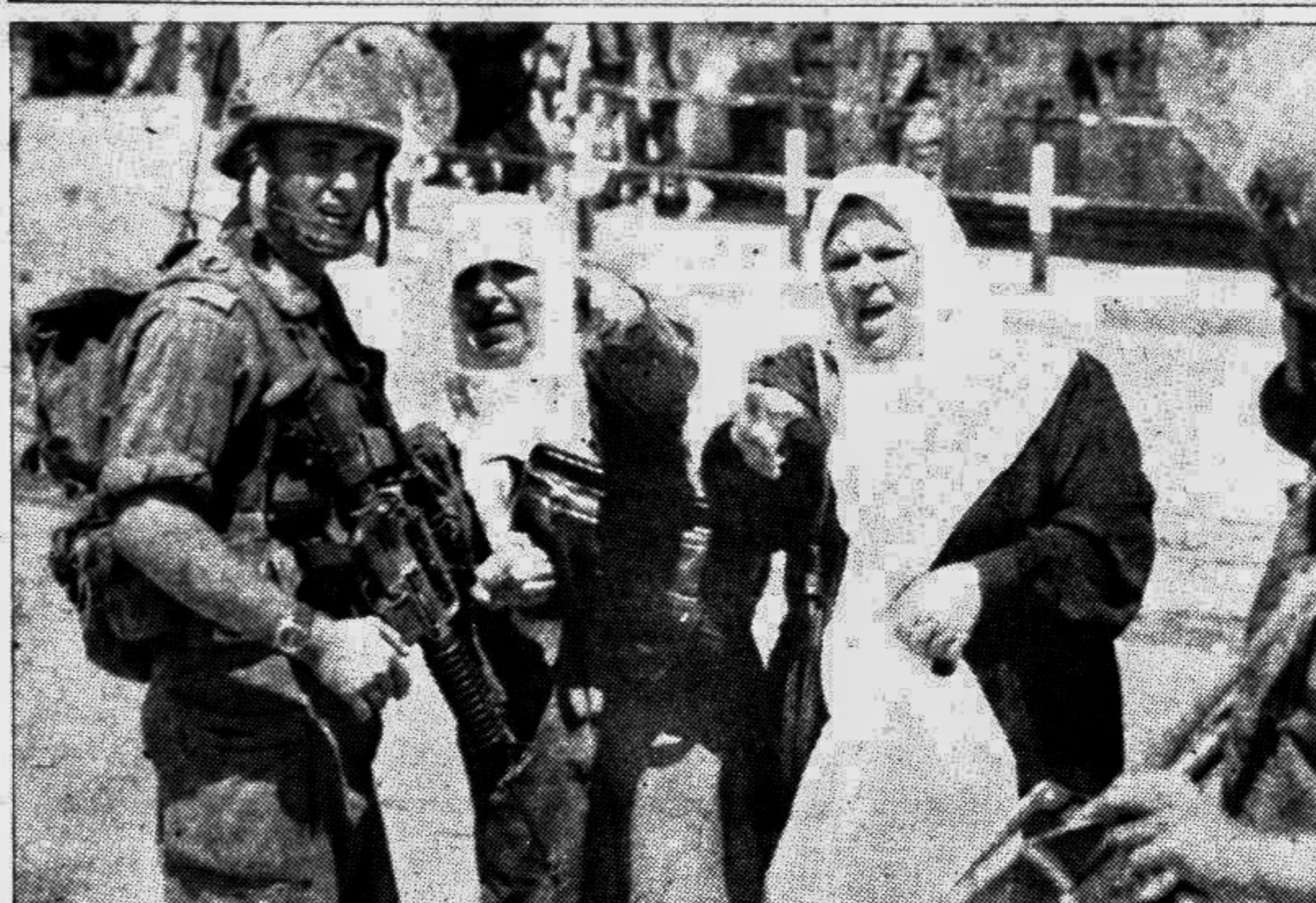
Two Palestinian mothers seeking the release of their sons, who were arrested following riots, argue with an Israeli officer in the West Bank town of Hebron yesterday.

The government has requested foreign observers for parliamentary elections this month and is likely to do so again for the year end presidential elections, she said.