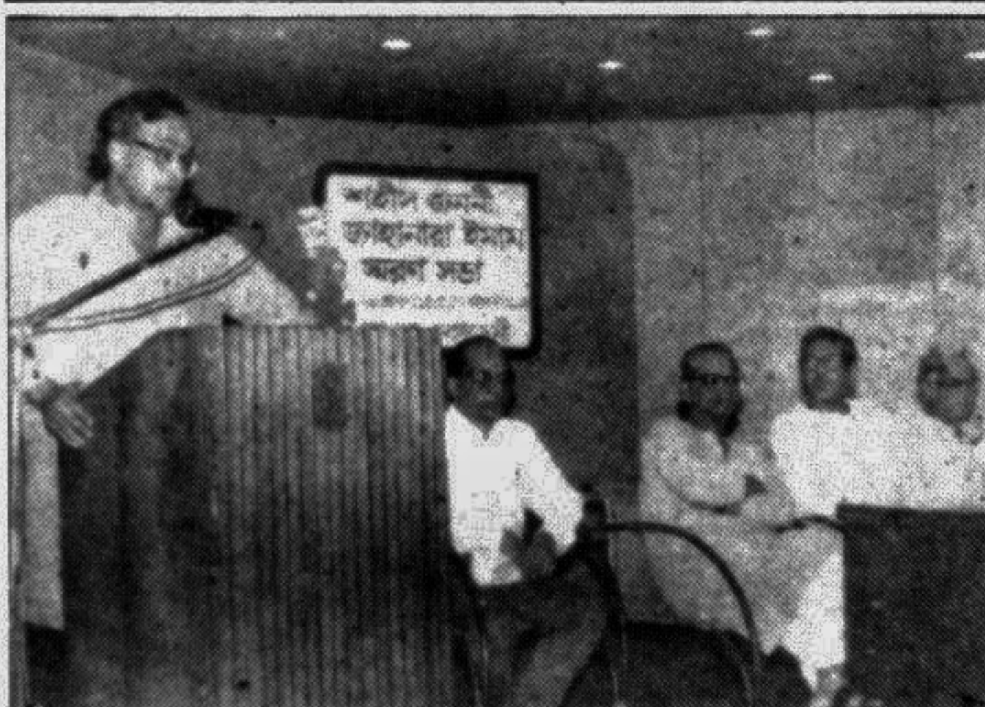
Playwright Mamtajuuddin Ahmed speaking at a memorial meet on Jahanara Imam at the Bangla Academy auditorium in the city yesterday.

The arrested, including 12 wanted criminals, two charged under the special powers act and six accused of stealing, were produced before court.