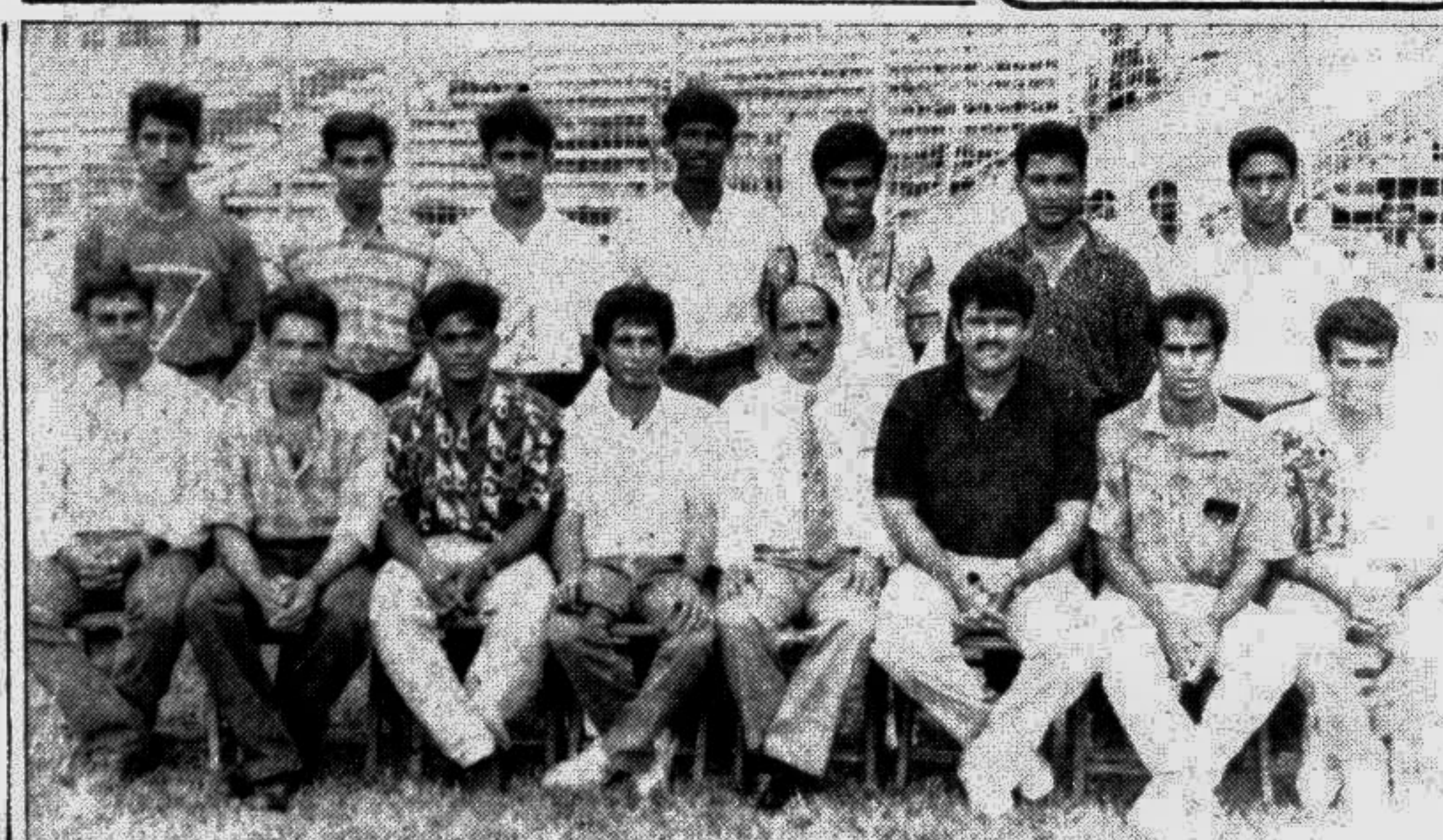
The players and officials of Dhaka Eleven which left the capital yesterday evening for the Indian city of Hyderabad to take part in the Moin-ud-Dowla Gold Cup cricket tournament.