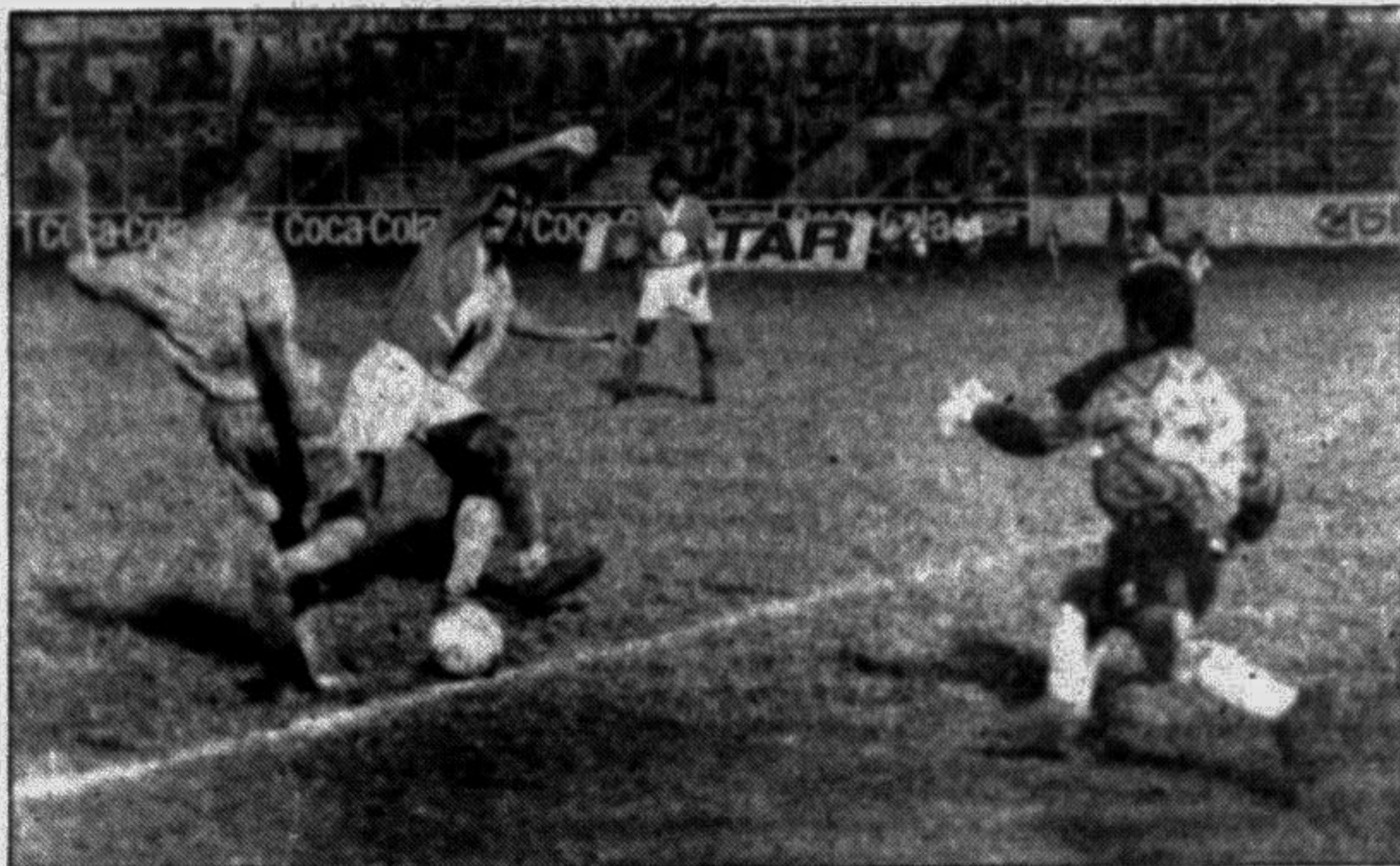
Action from yesterday's Star Premier Division football league match between title aspirants Abahani KC and Public Works Department (PWD) at the Dhaka Stadium. PWD held the DMFA Cup champions to a goalless draw.

Barcelona's star combination of Romanian midfielder Gheorghe Hagi and Bulgarian striker Hristo Stoichkov outplayed Bayern's four-square defence several times only to be foiled by the post or the reflexes of new goalkeeper Oliver Kahn.