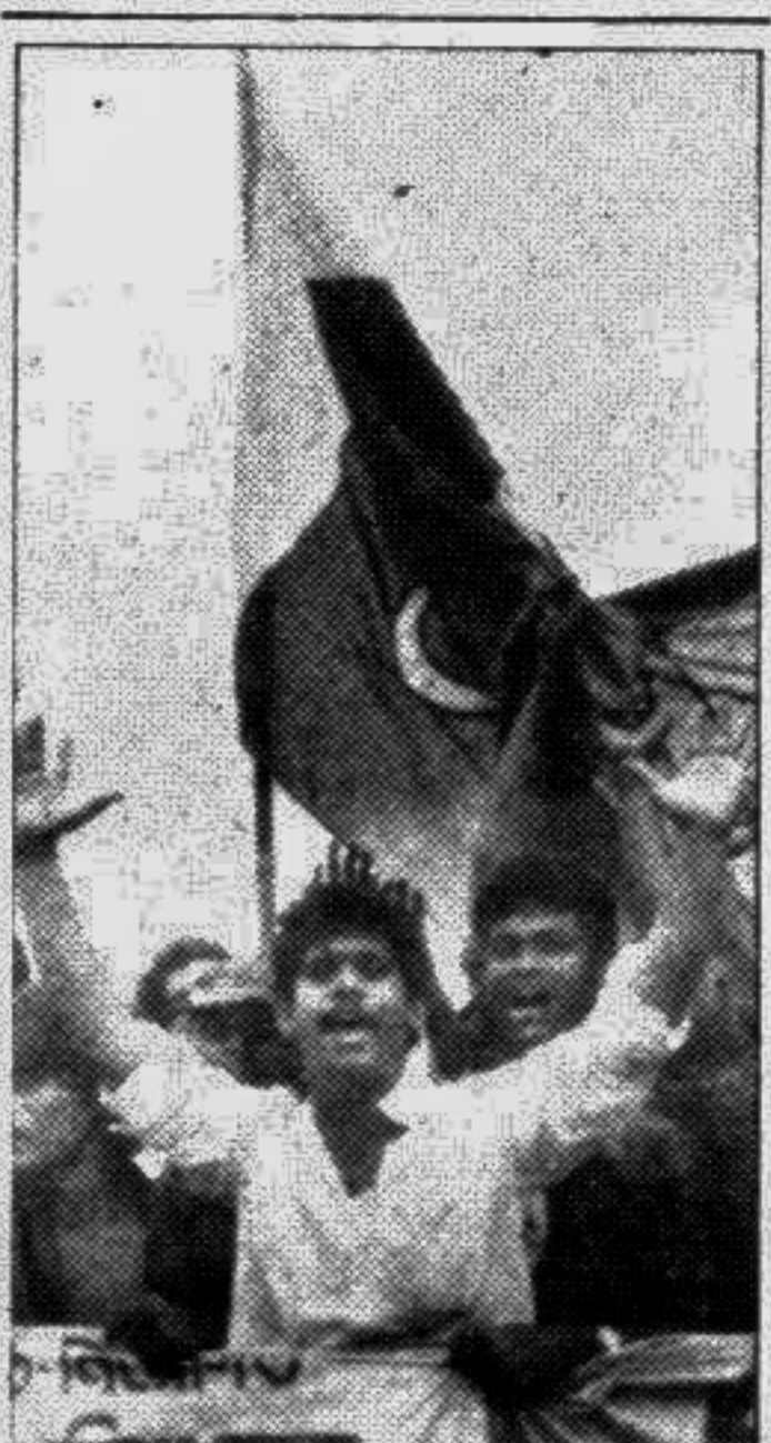
The stranded Pakistanis brought out a procession in the city yesterday demanding their return to homeland.

The institute was constructed at a cost of Taka two crore and four lakh to provide health services to the local people.