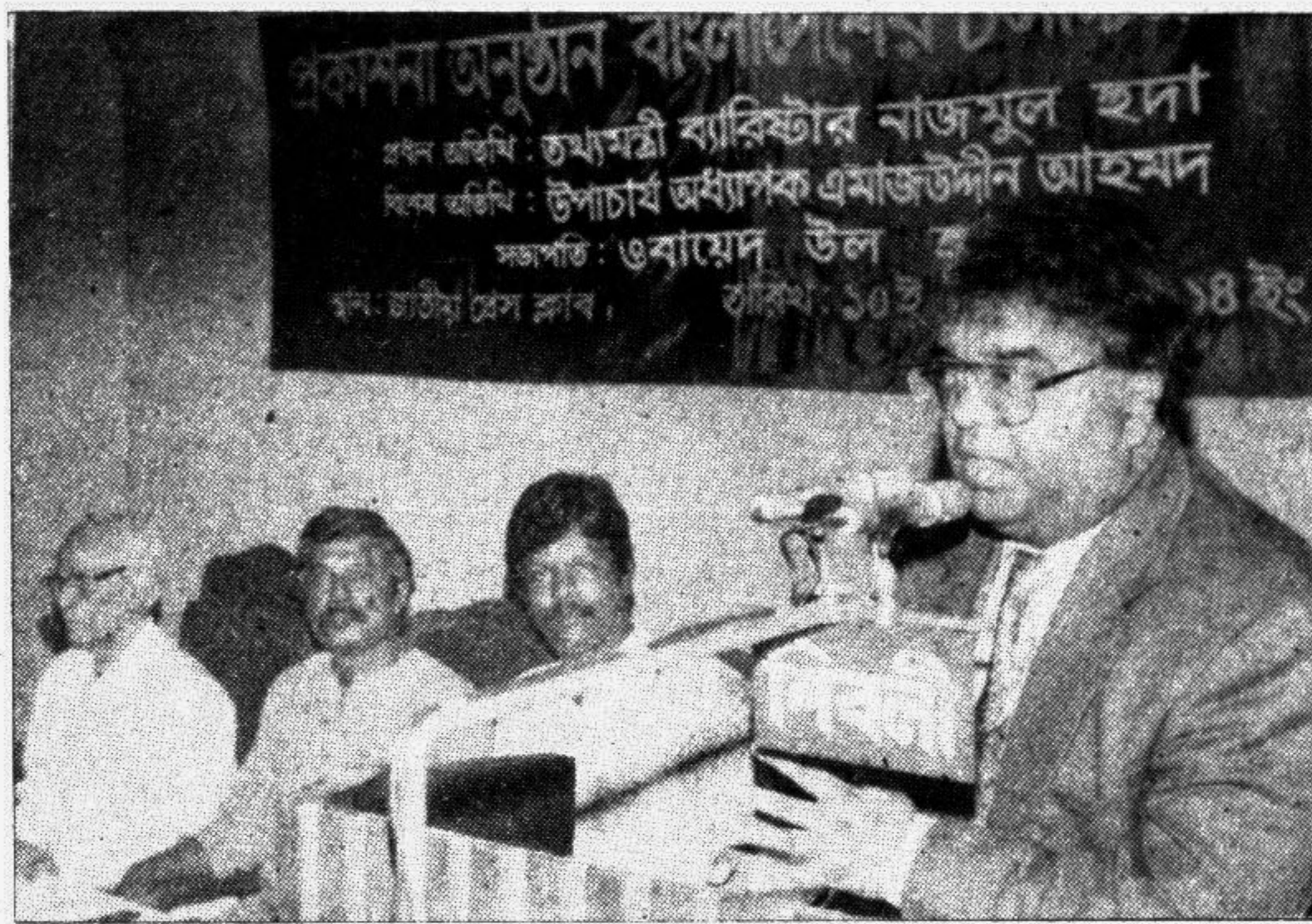
Minister for Information Nazmul Huda speaking as chief guest at the publication ceremony of the book Bangladesher Chalachitra Shilpa at the National Press Club auditorium in the city yesterday.

While the government so far listed only 29 cases of HIV positive, a number of clinics in the capital were reported testing and treating AIDS patients, in most cases secretly, say activists.