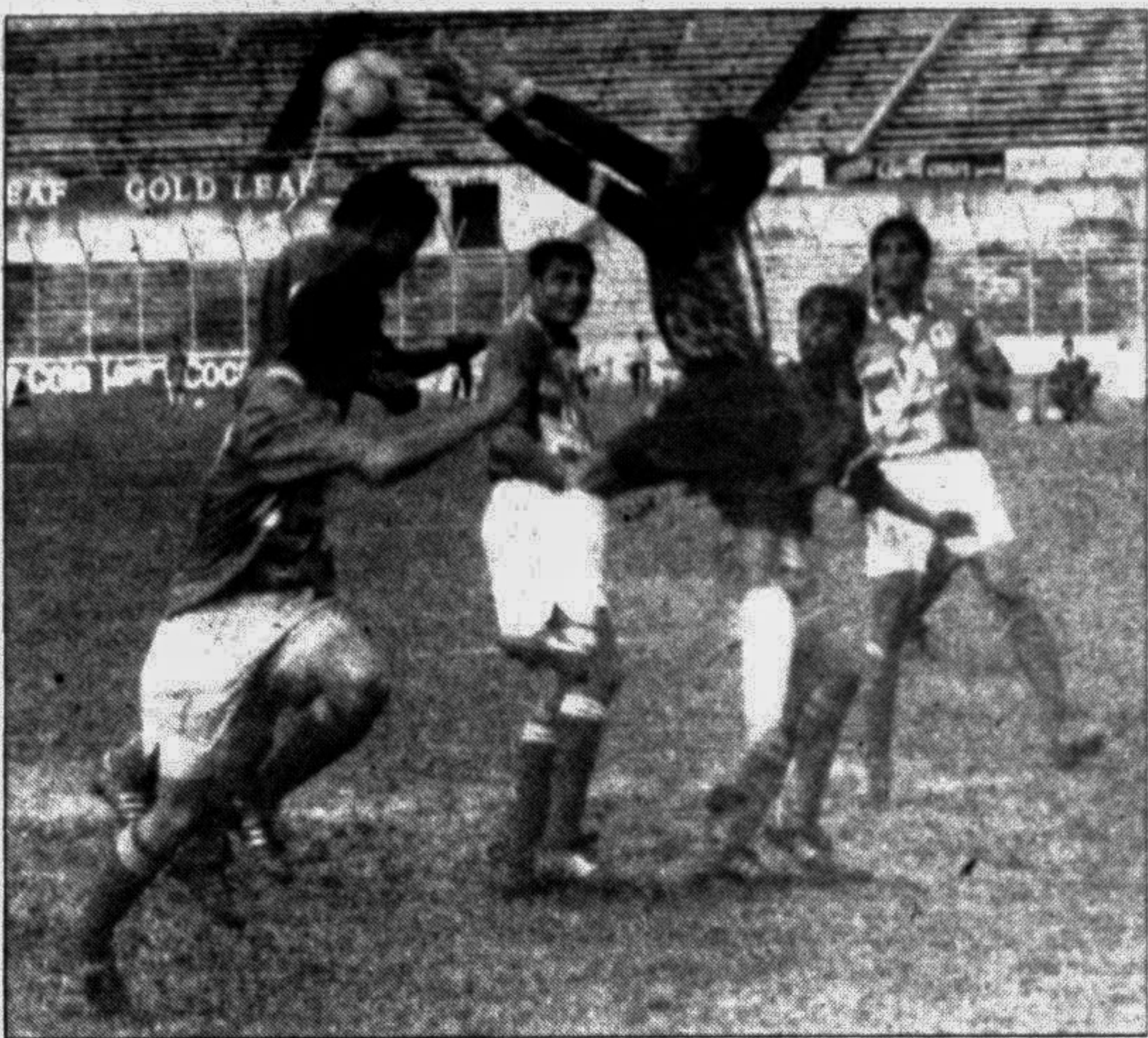
Action from yesterday's Star Premier Division football league match between Muktiyoddha Sangsad KC and Agrani Bank at the Dhaka Stadium. Muktiyoddha won 4-2.