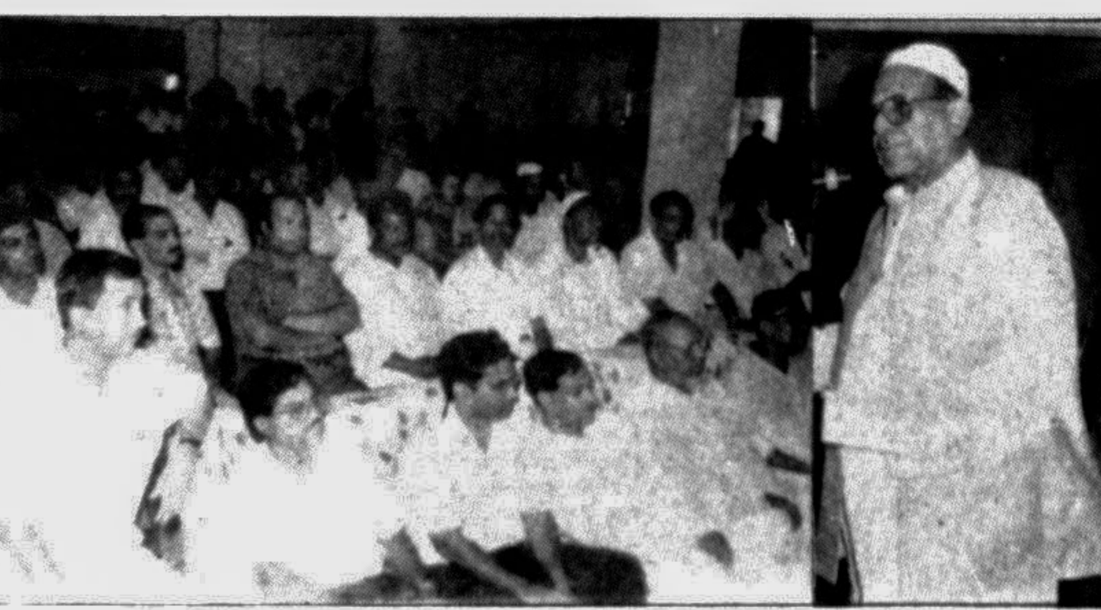
SYLHET: Abdus Samad Azad, Deputy Leader of the Opposition in Parliament speaking at a meeting to arrange negotiations between the district administration and transport workers owners and to end the 9-day long transport strike in Sunamganj district. A number of MPs, government officials and others attended the meeting.