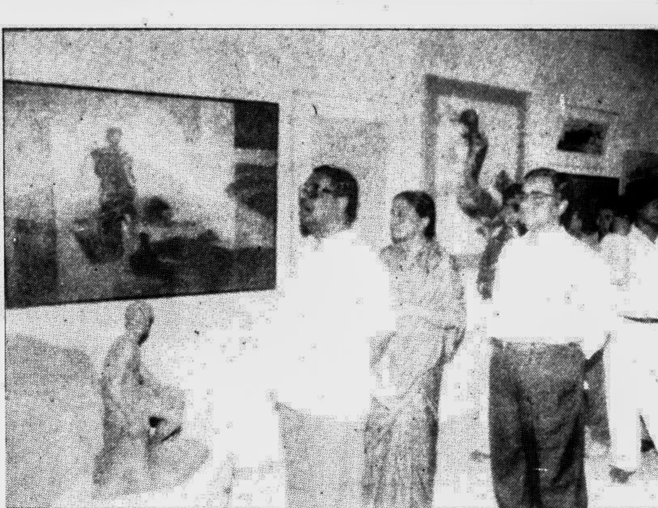
CHITTAGONG: The annual art exhibition '94 of the Department of Fine Arts of the Chittagong University inaugurated recently.