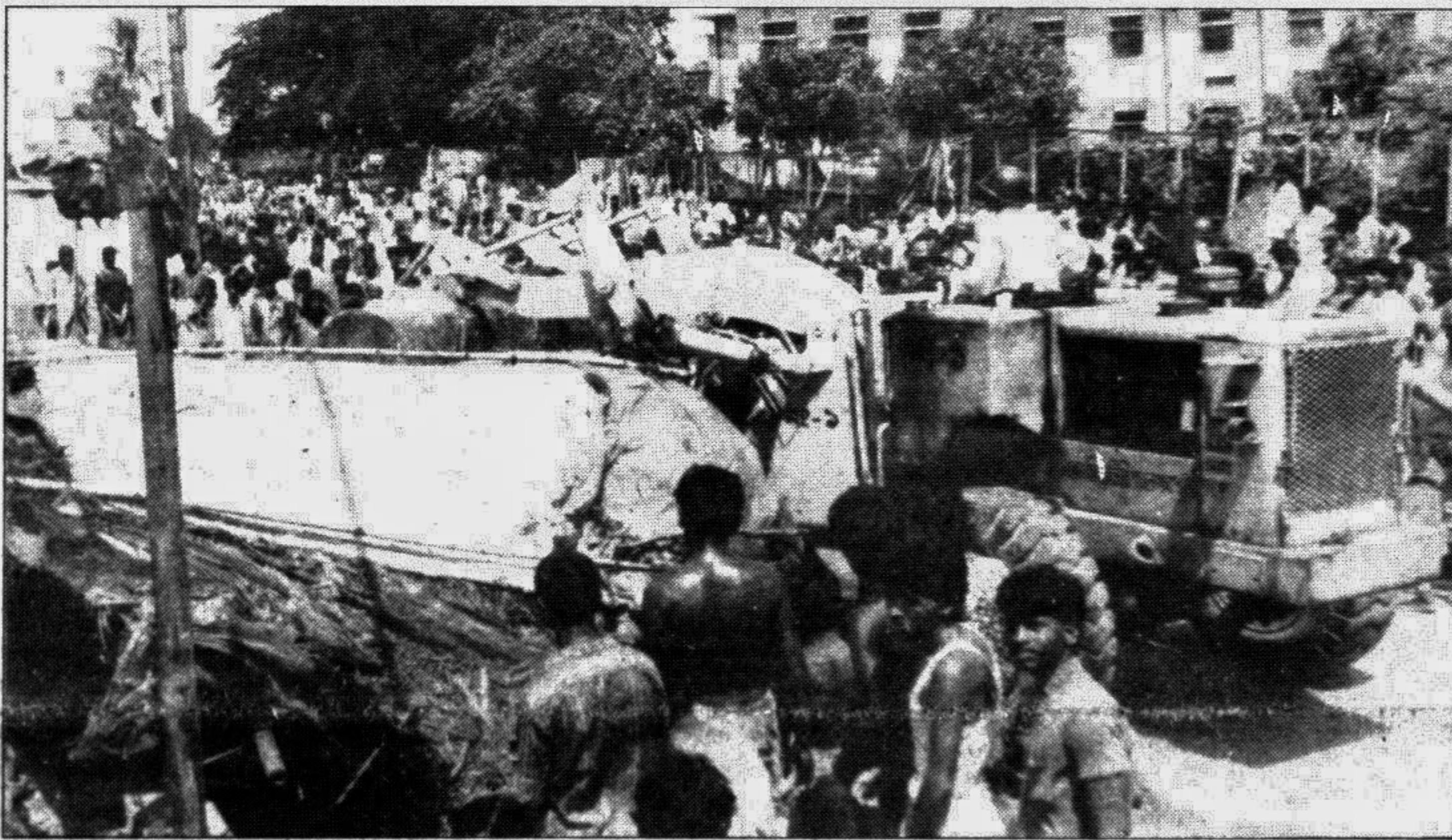
The Dhaka City Corporation (DCC) demolishing unauthorised shops and structures on the Ghaznavi Road beside the Geneva Camp in Mohammadpur yesterday.