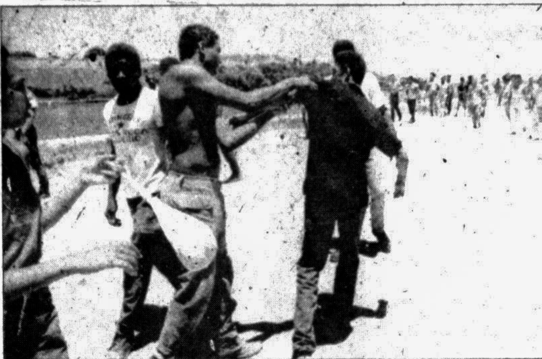
A Cuban woman (L) watches as her husband (R) is arrested during anti-government demonstrations Friday on the waterfront in Havana. Protesters hurled stones at police and attacked businesses in clashes that left an unspecified number of people injured.

KIGALI, Aug 6: After tribal slaughter, civil war and the flight of millions of frightened people from their homes, and farms, Rwanda faces another nightmare — famine, reports Reuters.