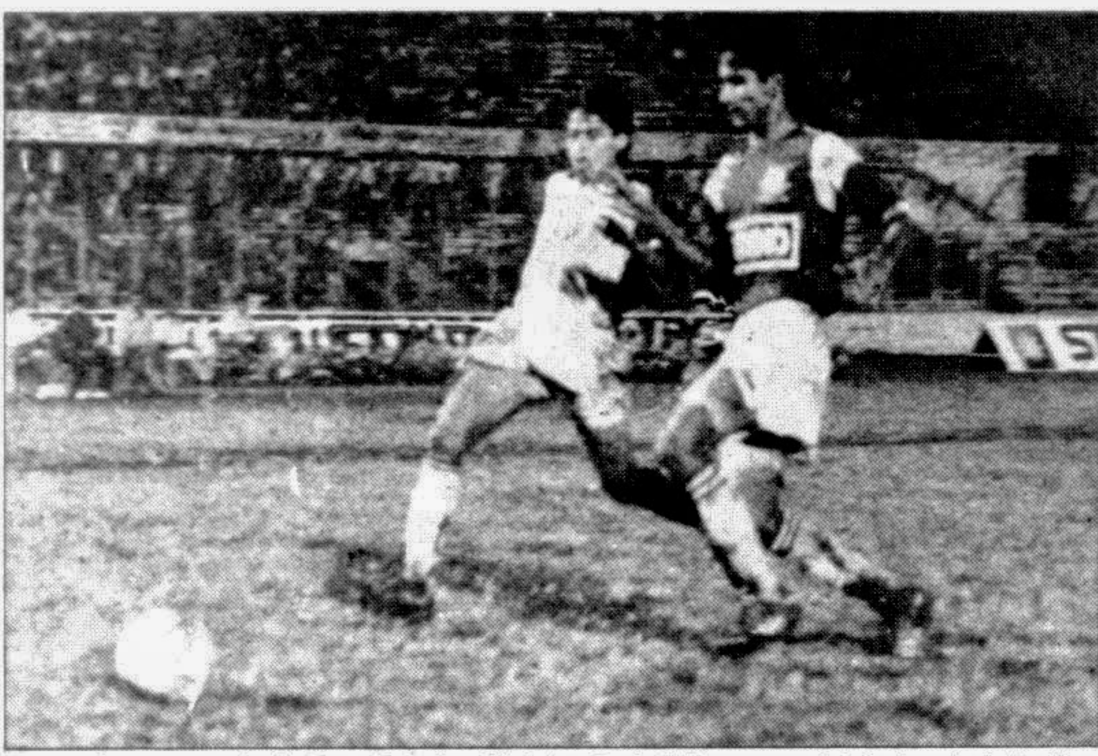
Action from yesterday's Star Premier Division football league match between defending champs Mohammedan Sporting Club and Wari Club at the Dhaka Stadium yesterday. The 'black and whites' won 1-0.