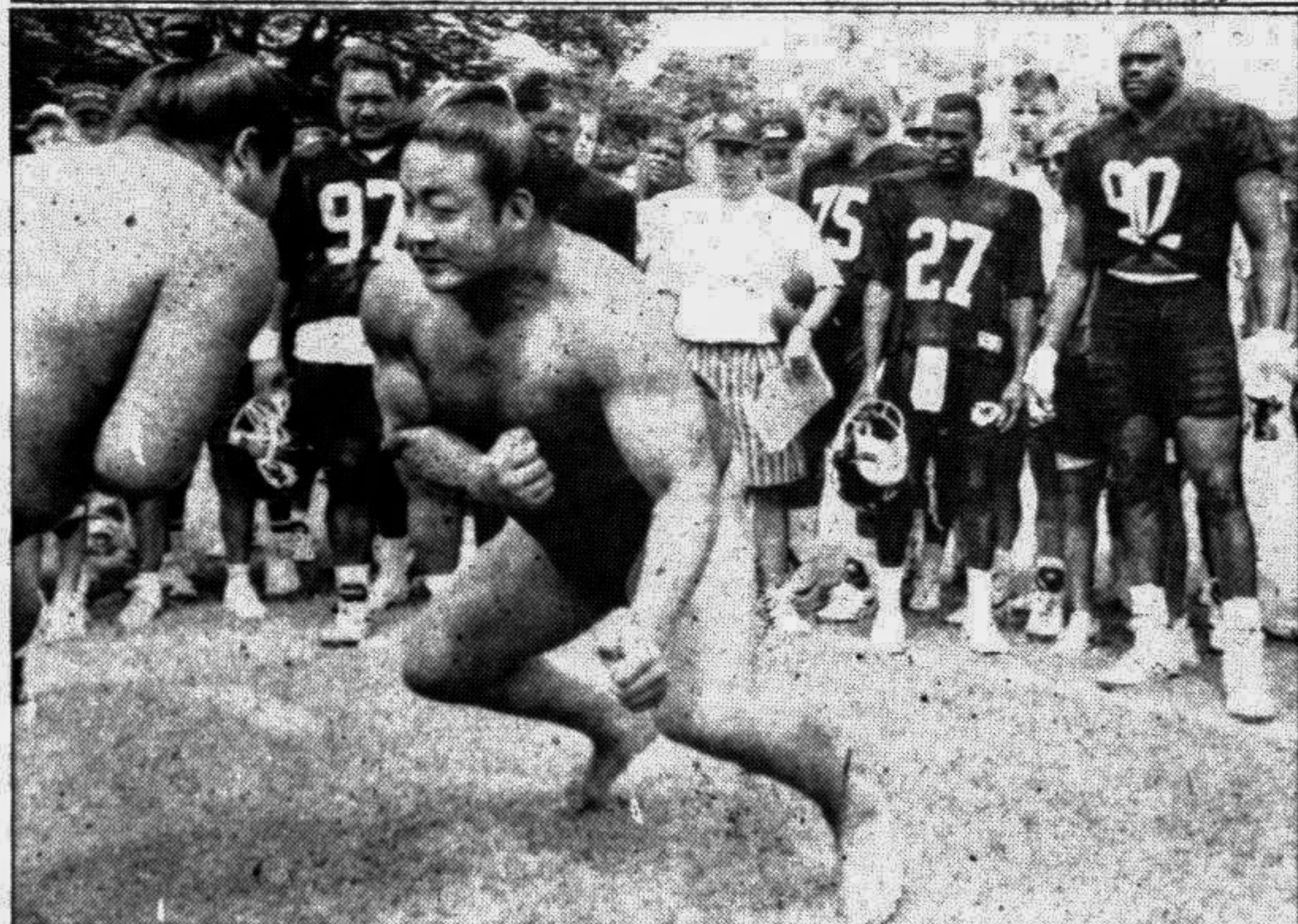
Members of the Kansas City Chiefs football team watch a demonstration of sumo wrestling before their practice session for a pre-season match against Minnesota Vikings in Tokyo yesterday.