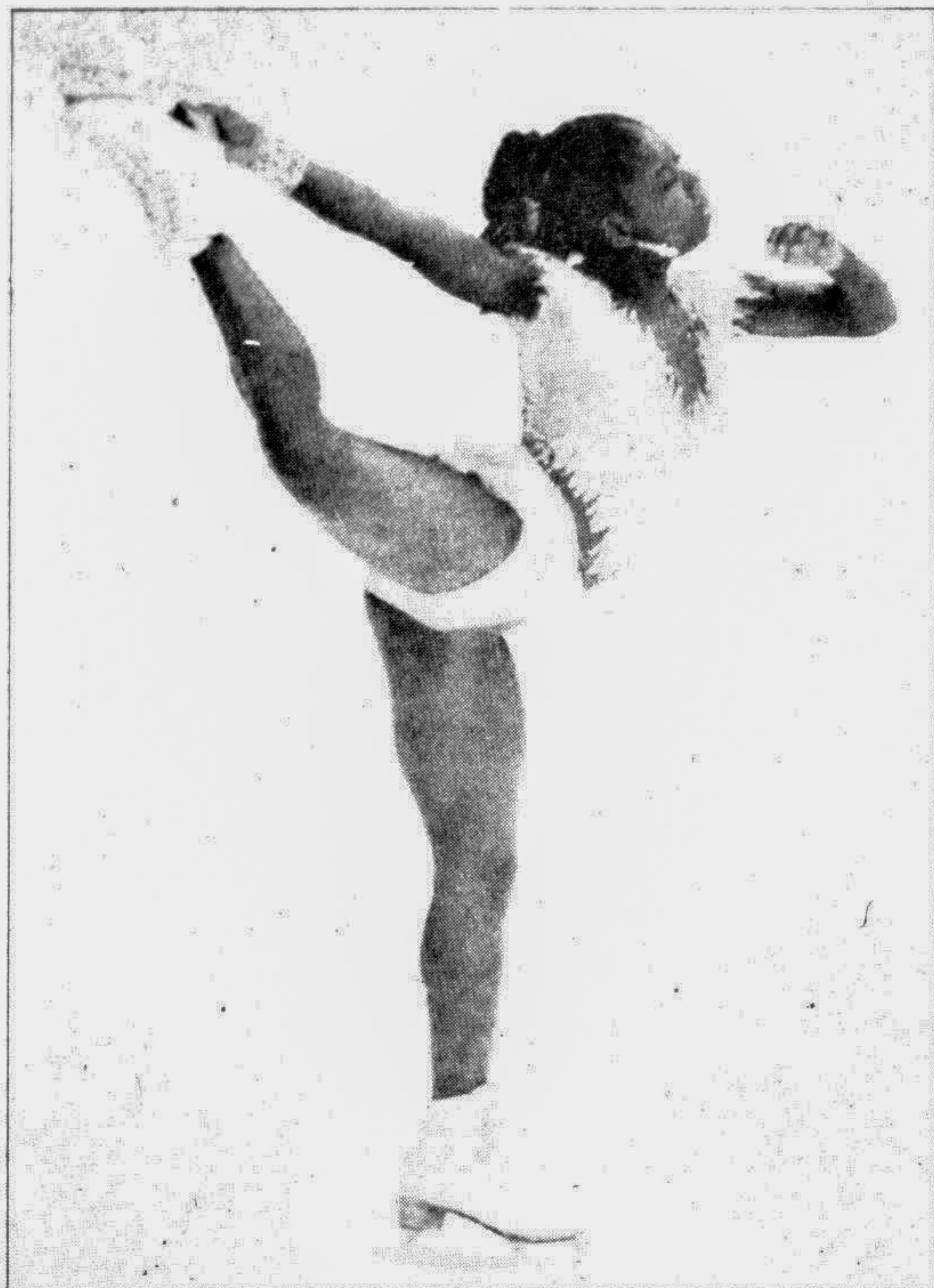
French skater Surya Bonaly performs during the women's technical programme of the Goodwill Games figure skating competition on August 4.