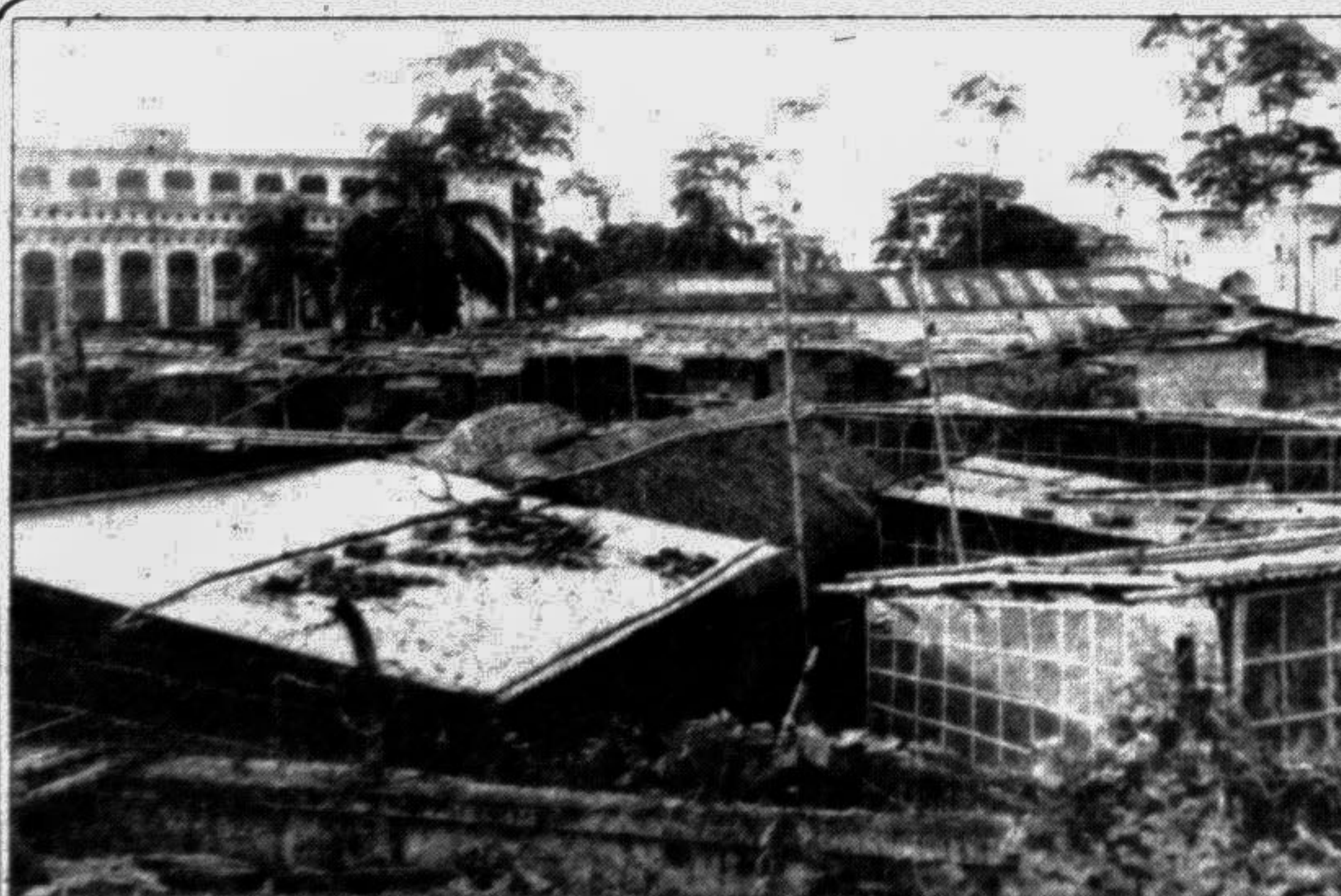
A partial view of the unauthorised slum near the Dhaka Medical College which has been vitiating the atmosphere of both the college as well as the country's biggest hospital.