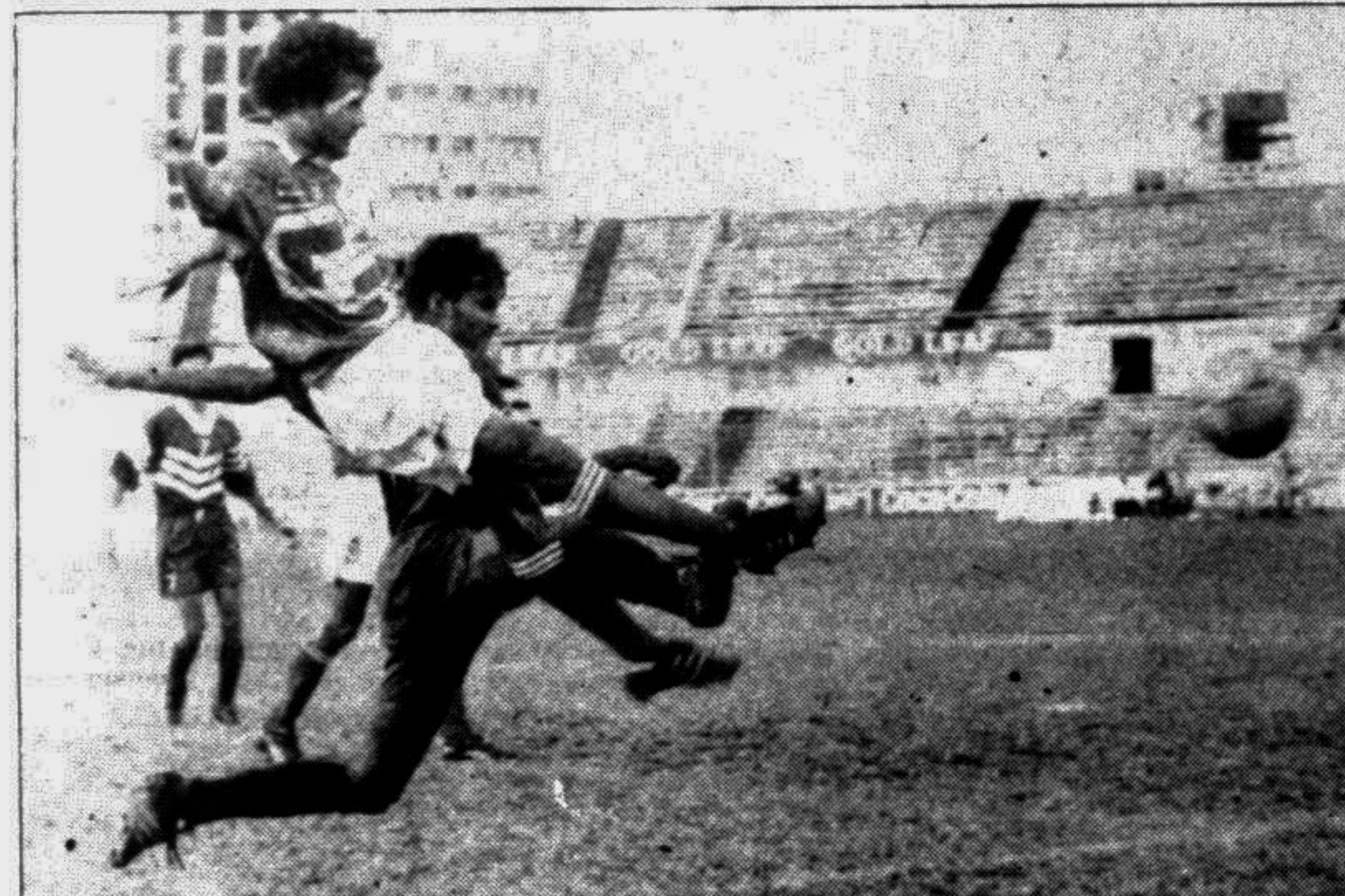
Action from yesterday's Star Premier Division football league match between Muktijoddha Sangsad KC and debutants Bangladesh Boys Club at the Dhaka Stadium yesterday. Muktijoddha blanked Boys 3-0.

The attacker fled the ground with the help of friends armed with pistols and knives. Police later arrested two suspects.