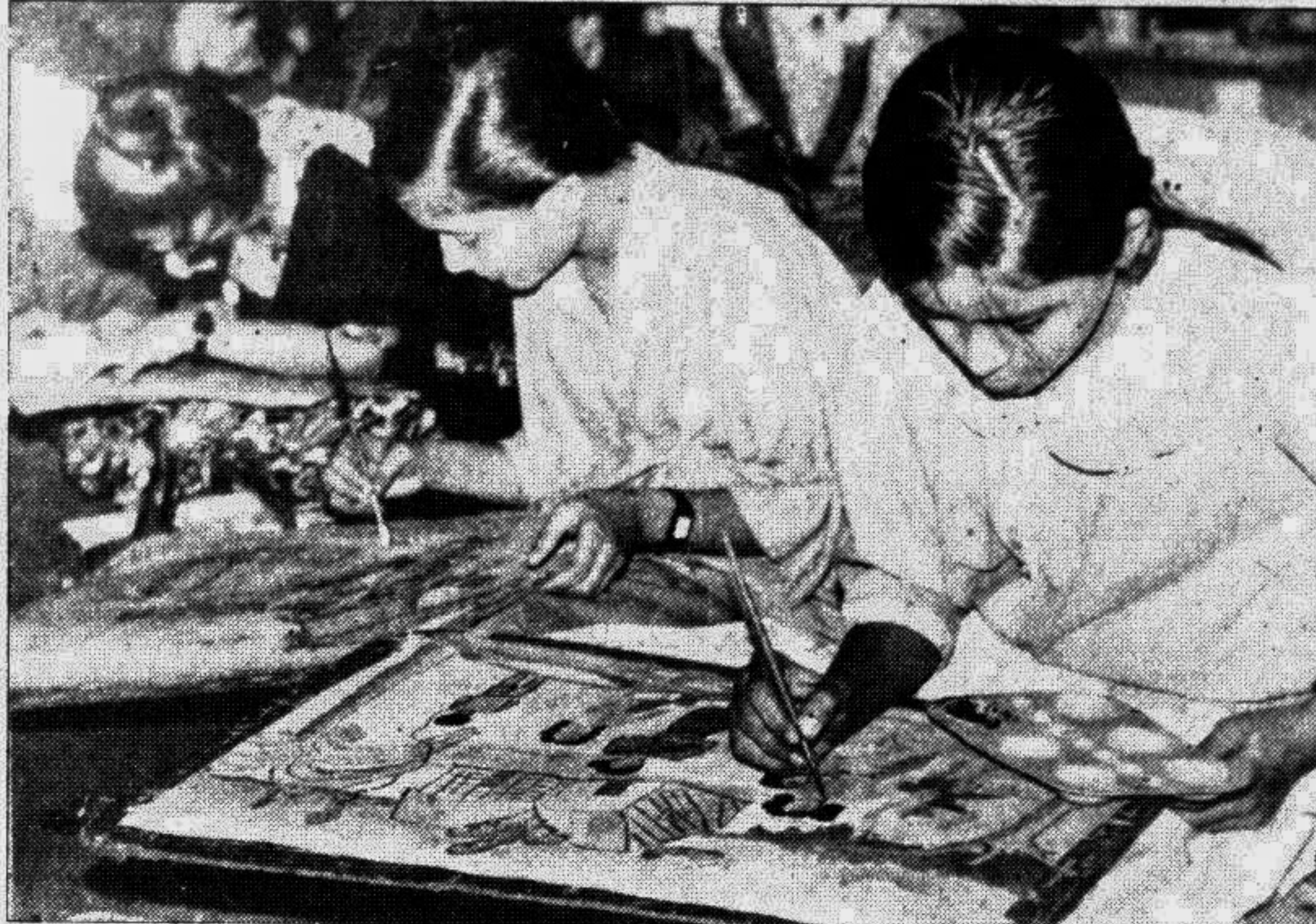
The Bangabandhu Sangskritik Parishad organised a drawing competition for children at the National Press Club yesterday.

A tiny voice inside you may suggest that the government should do something in the direction of imposing tougher sanctions on air polluting vehicles. It is at this time that one may remind you of a curious fact: some of the blackest and foulest of smoke is emitted from police jeeps and trucks. No wonder, the so called 'Traffic Weeks' declared every now and then have not been able to stop the artificial black clouds of smoke that darken Dhaka's skies more ominously than any 'Kul Boishakh'.