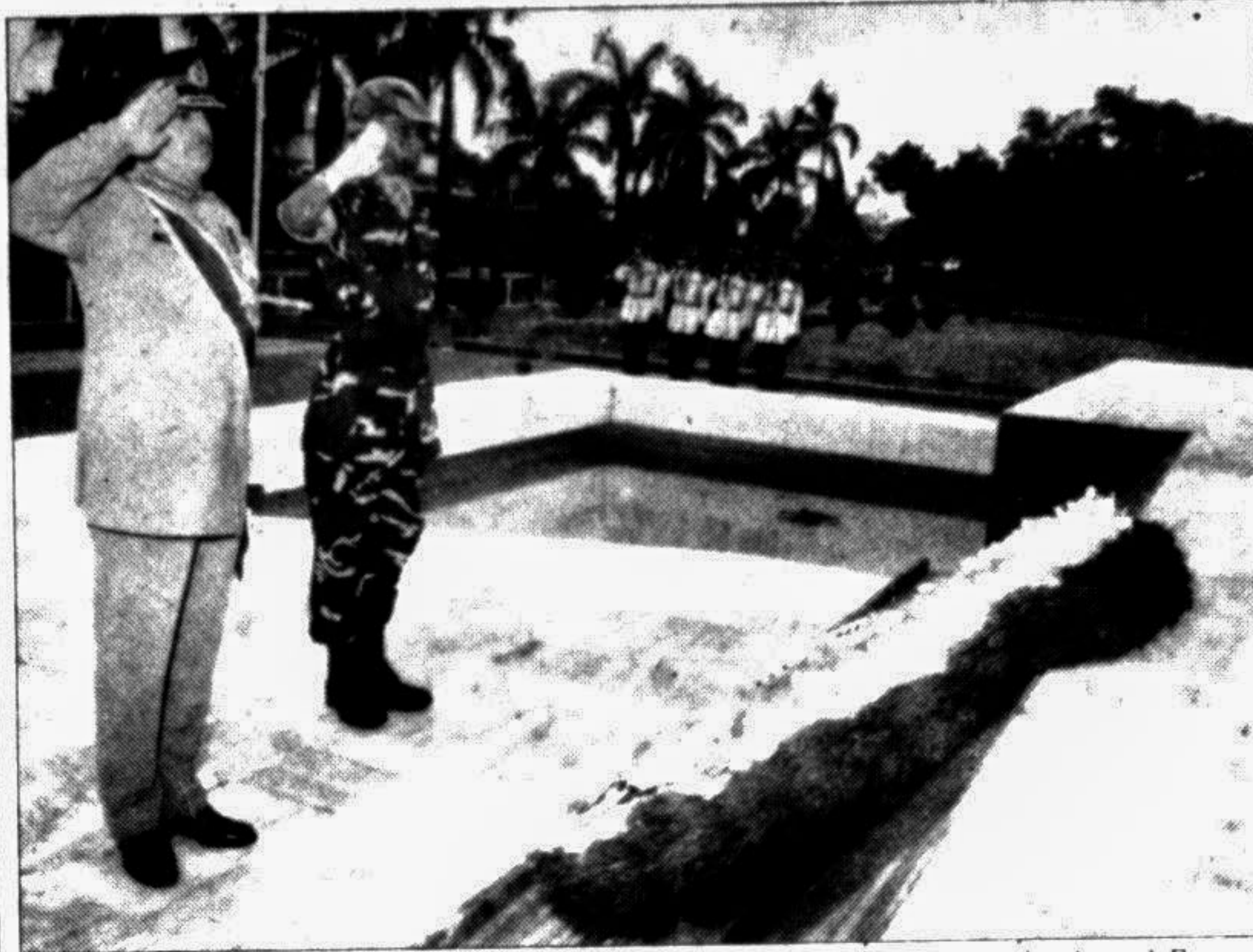
Pakistan Army Chief of Staff General Abdul Waheed paying homage to the Armed Forces personnel martyred during the War of Liberation in 1971 after placing wreath at the Shikha Anirban (Eternal Flame) at the Dhaka Cantonment yesterday.

In the evening a seminar on 'The necessity to organise a debate' was held at the same venue. It was participated by students of the universities of Dhaka, Jahangirnagar, Sylhet, Rajshahi and different colleges.