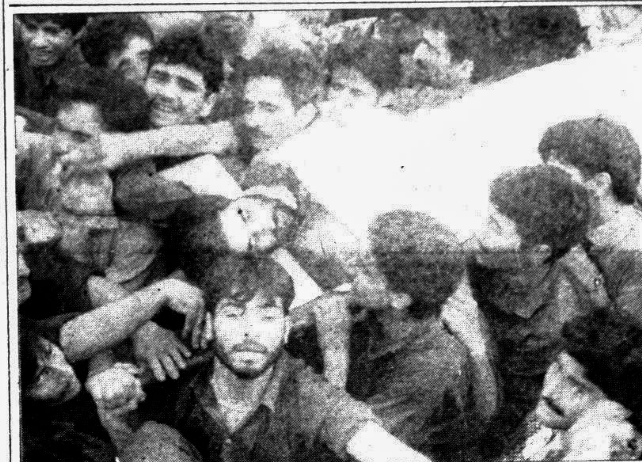
Mourners carry the body of a Hizb-ul-Mujahideen militant for burial yesterday in northern Kashmir following a fierce battle between Muslim secessionists and Indian security forces. At least six persons were killed in the battle.

Political analysts said that the fate of beleaguered Koirala now hangs on the final verdict of the Supreme Court.