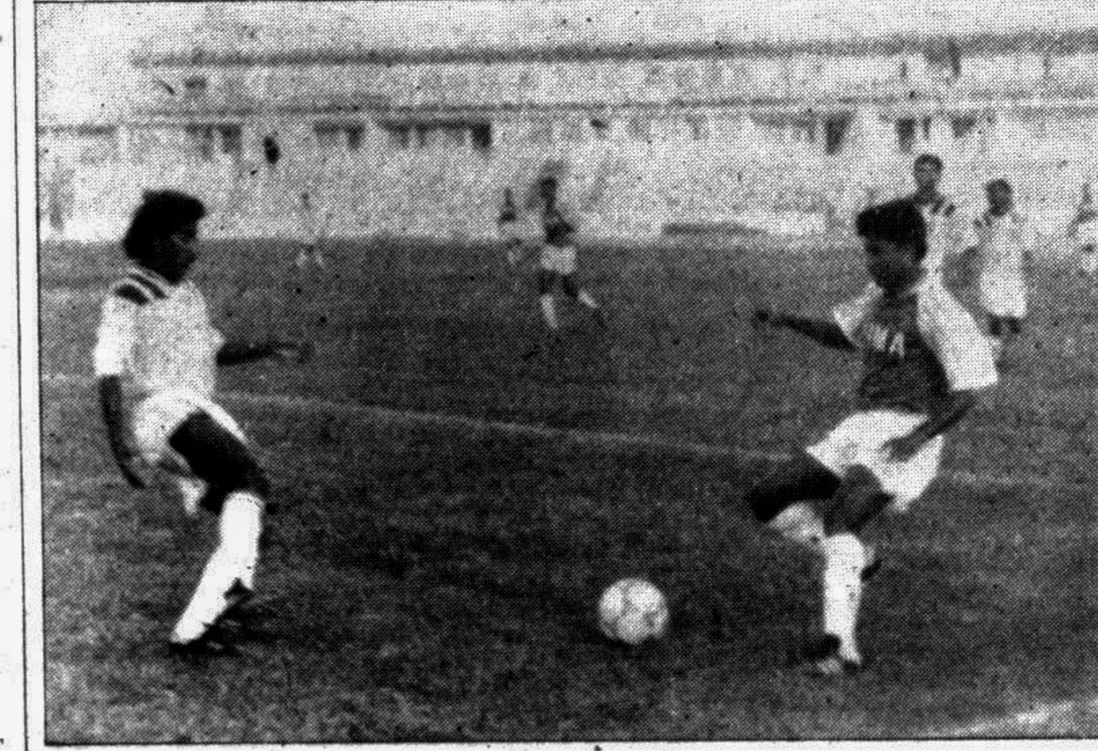
Action from yesterday's lone Star First Division football league match between Sadharaan Bima KS and Dhaka Wanderers Club at the Dhaka Stadium. Bima won the match 3-1.