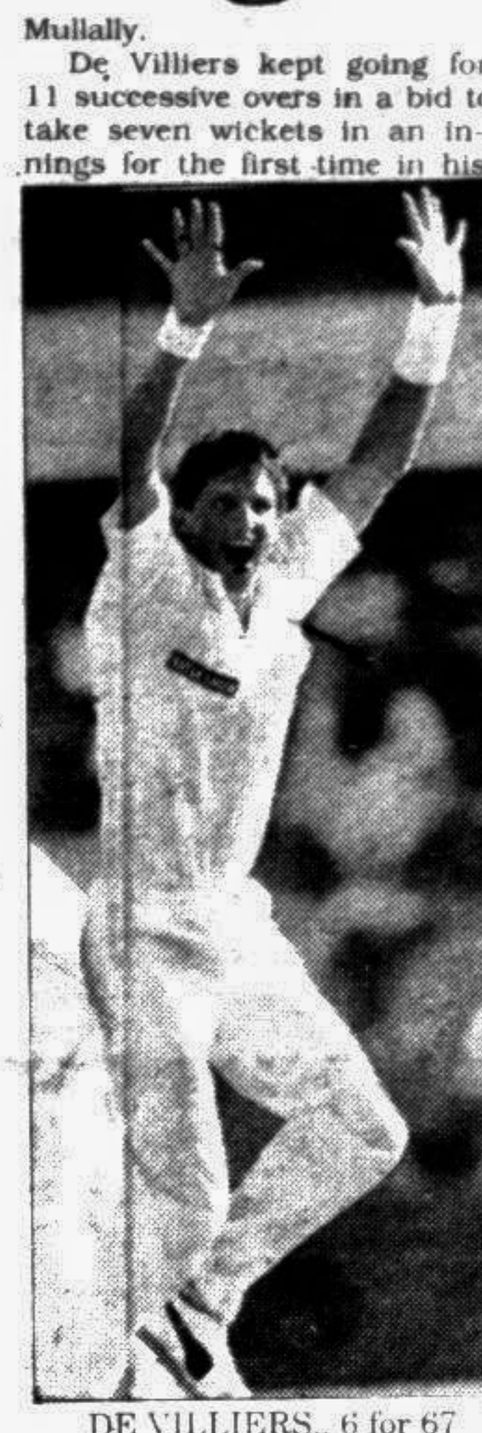
DE VILLIERS, 6 for 67

MONTE CARLO, Aug 1: An attempt on the 3,000 metres world record should highlight a glittering night of athletics in Monaco on Tuesday, reports Reuter. Algerian Noureddine Morcelli, who already holds the mile and 1,500 metres world records, will be bidding to break the seven minutes 28.96 seconds set by Kenyan Moses Kiptanui in Cologne two years ago this month. Morcelli missed the mark by just a couple of strides — 0.28 of a second — at the same meeting last summer, but is expected to better it this time. Two other African world record holders are in the field of 16 — Ethiopian Haile Gebresilasie (5,000 metres) and Kenyan William Singel, who broke the 10,000 metres best in Oslo last month. Italy's Francesco Panetta, European 3,000 metres steeplechase champion, and Kenyans Ismael Kirui, world