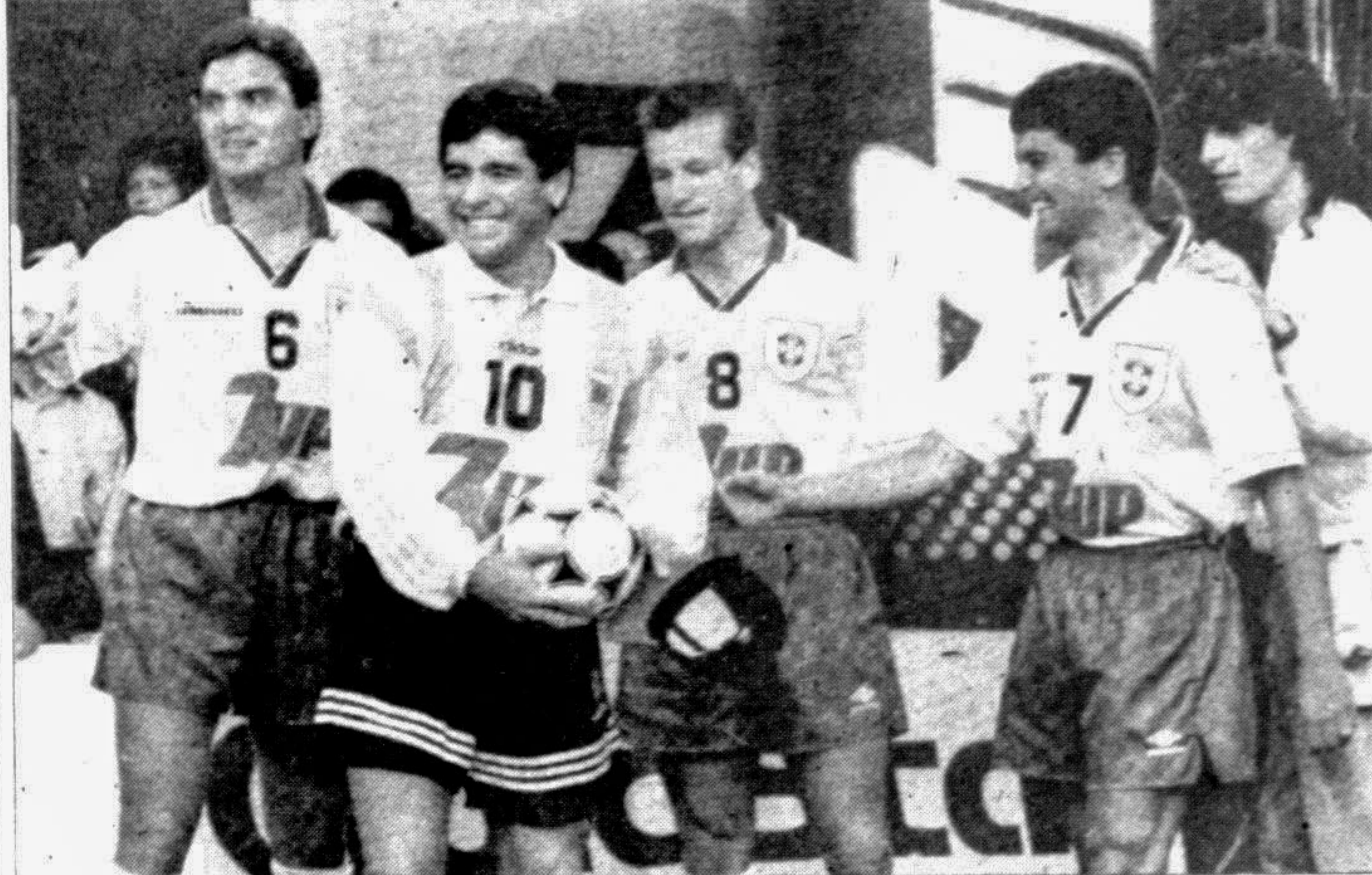
The Argentine superstar Diego Maradona (2nd-L) poses along with the Brazilian soccer stars Branco (L), Dunga (2nd R) and Bebeto before a brief exhibition match staged in the studios of a Buenos Aires television station on July 31. The world champions won the four-a-side match 7-4.