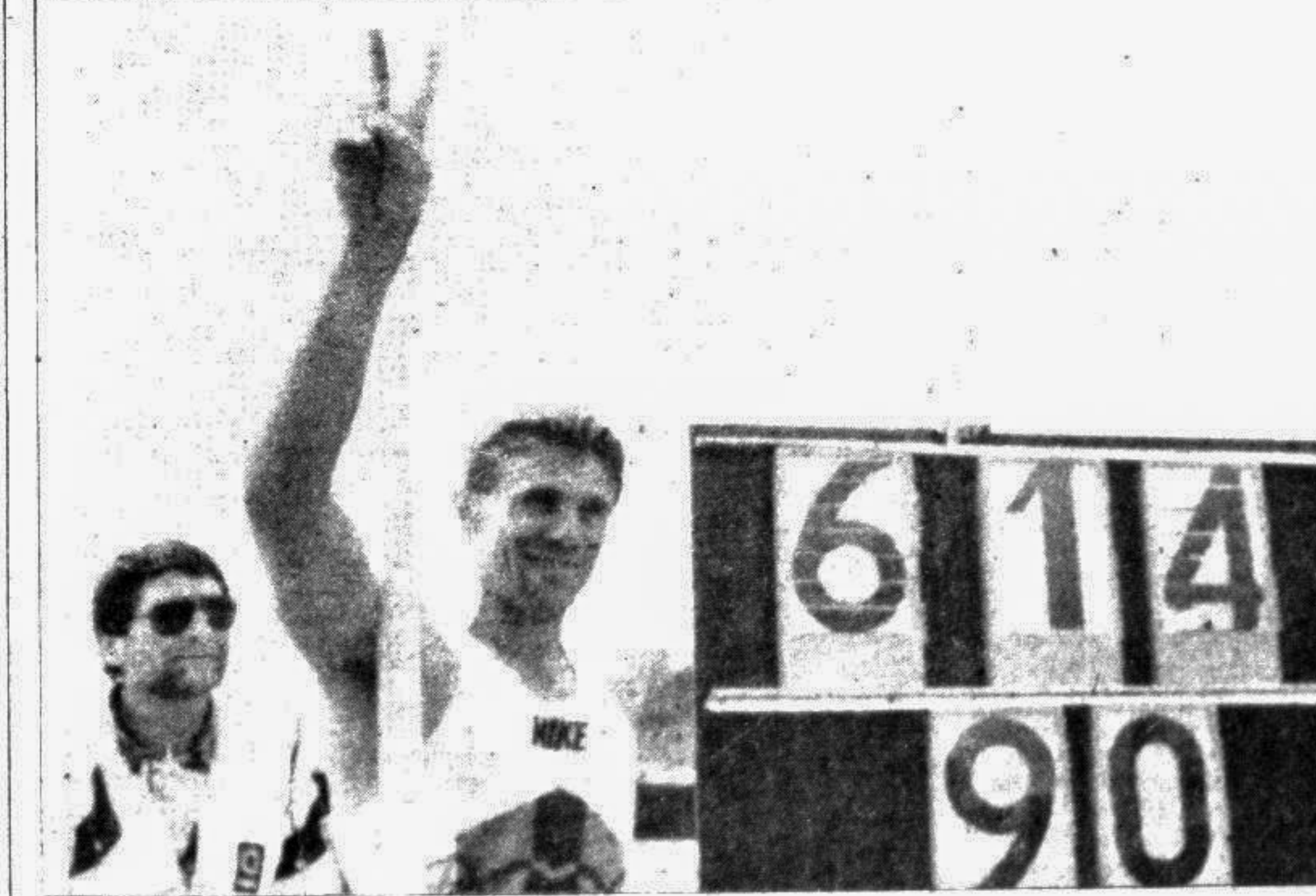
VICTORIOUS BUBKA: Ukrainian pole vault champion Sergei Bubka flashes the V-sign after setting a new record of 6.14 metres at an international athletics meeting in Sestriere, Italy on July 31.