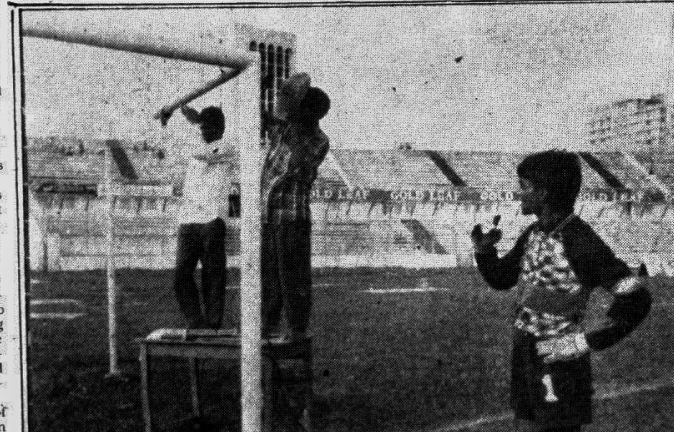
We may not have the privilege to be witness to a Stoichkov cracker but we certainly have it in us to keep up with the novelties without the ball that go around. Handymen of the organisers of the Senior Division football leagues (DMFA) are seen fixing the goal post causing a 15-minute delay in the beginning of the Star Premier tie between Muktiyoddha and PWD at the Dhaka Stadium yesterday.

"Well those of us who have played against them know that they are not devils, but neither are they saints by a long shot."