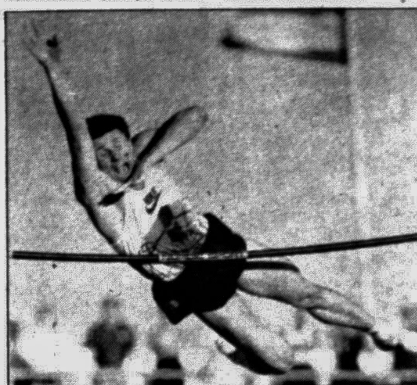
BUBKA...has only himself to beat

he gets paid handsomely) but has said: "I like this life of sport, if I made one big jump it would be harder to get motivated at future meets."