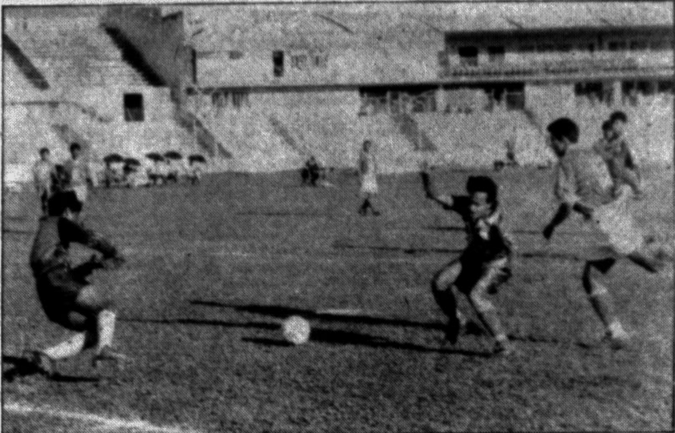
Action from yesterday's Star Premier Division football league match between newly crowned Federation Cup champions Muktiyoddha Sangsad KC and PWD Sports Club at the Dhaka Stadium. Muktiyoddha won 3-0.