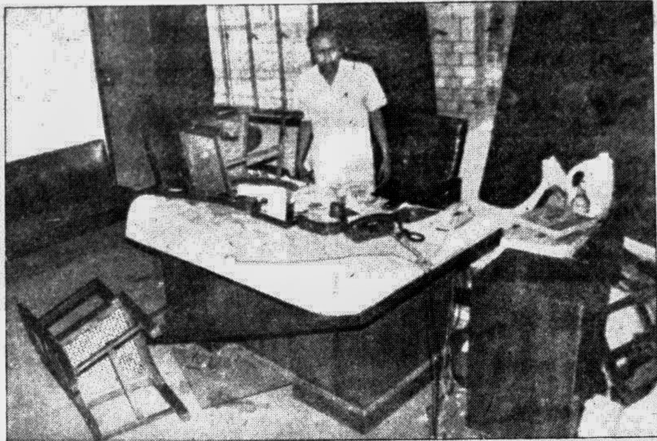
A group of hartal supporters ransacked the room of the Bangla Academy press manager for defying the hartal call yesterday.