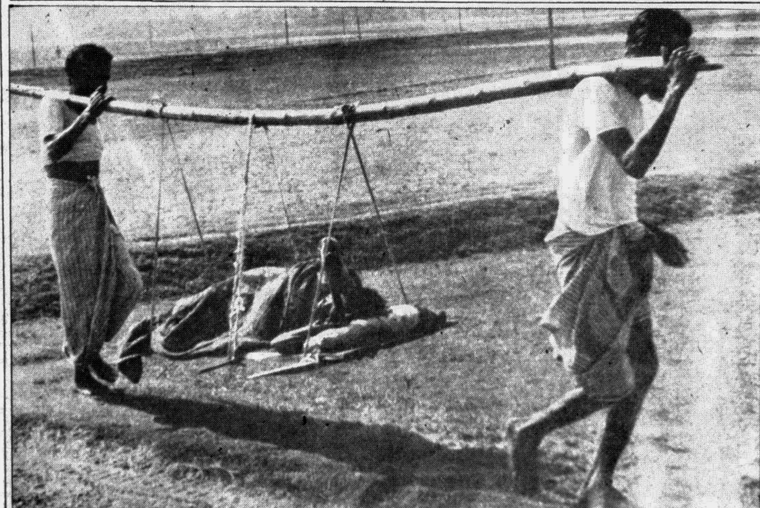
BRAHMANBARIA: In the absence of ambulance services, the local people use such a method to carry patients to the local health complex.

July 30: The BDR Javans seized a huge quantity of bicycle parts worth about Tk 27,000 from the frontier area on Tuesday, reports UNB. Acting on a tip off BDR personnel challenged a group of smugglers and seized the spare parts. The BDR sources said the smugglers fled the scene leaving the contraband items as they were challenged by them.