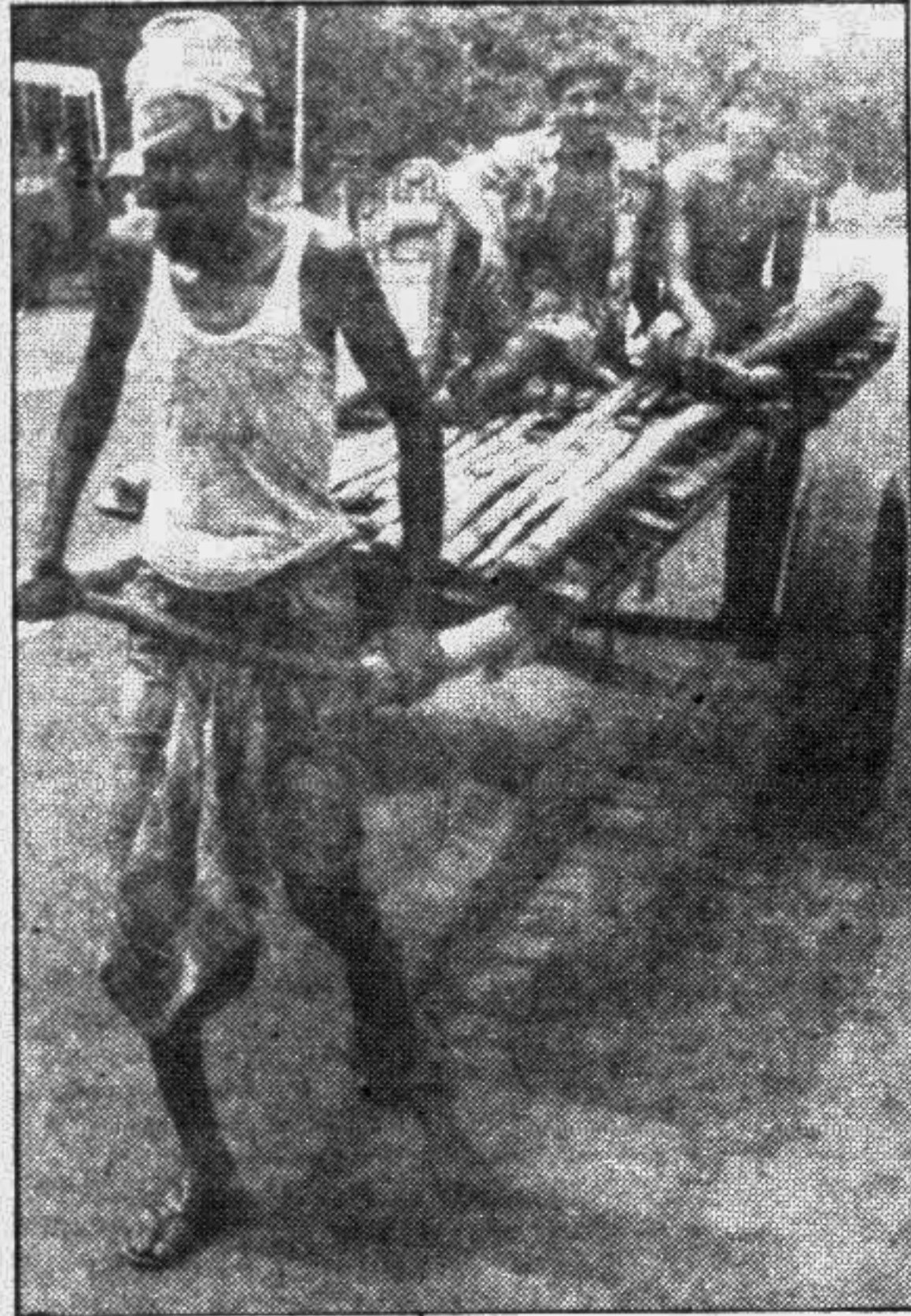
Pushing to the limit of Physical Strength.

Whatever may be the arguments, they are in the street leading a substandard life. That is the hard fact.