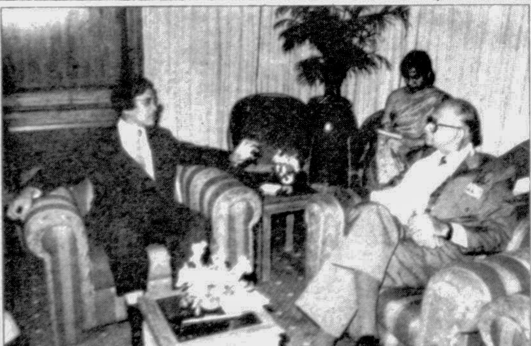
Bhutanese Foreign Minister Lynpo Dawa Tsering, who is representing his country to the fourteenth SAARC Council of Ministers meeting in Dhaka, called on Foreign Minister ASM Mostafizur Rahman at hotel Sheraton yesterday.

Lions Club of Dhaka Dynamic: The regular weekly meeting will be held. Lt Abu Hasan Khan will preside. Venue: TCL 1, Outer Circular Road, Moghbazar. Time: 7 pm.