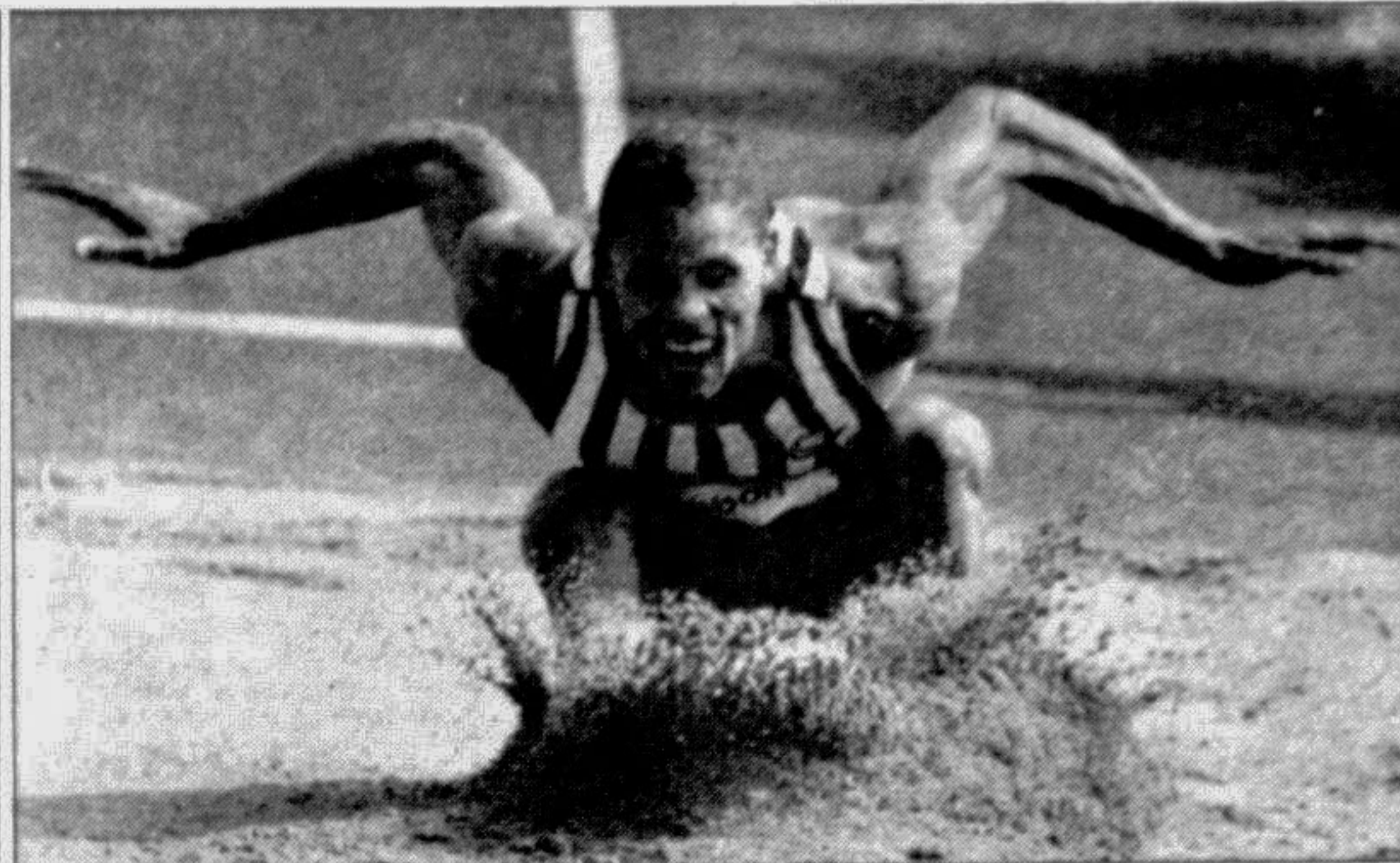
American decathlete Dan O'Brien lands after jumping 7.81 metres during the long jump event in the Goodwill Games in St Petersburg yesterday. O'Brien hopes to be the first man ever to break 9,000 points in the event.