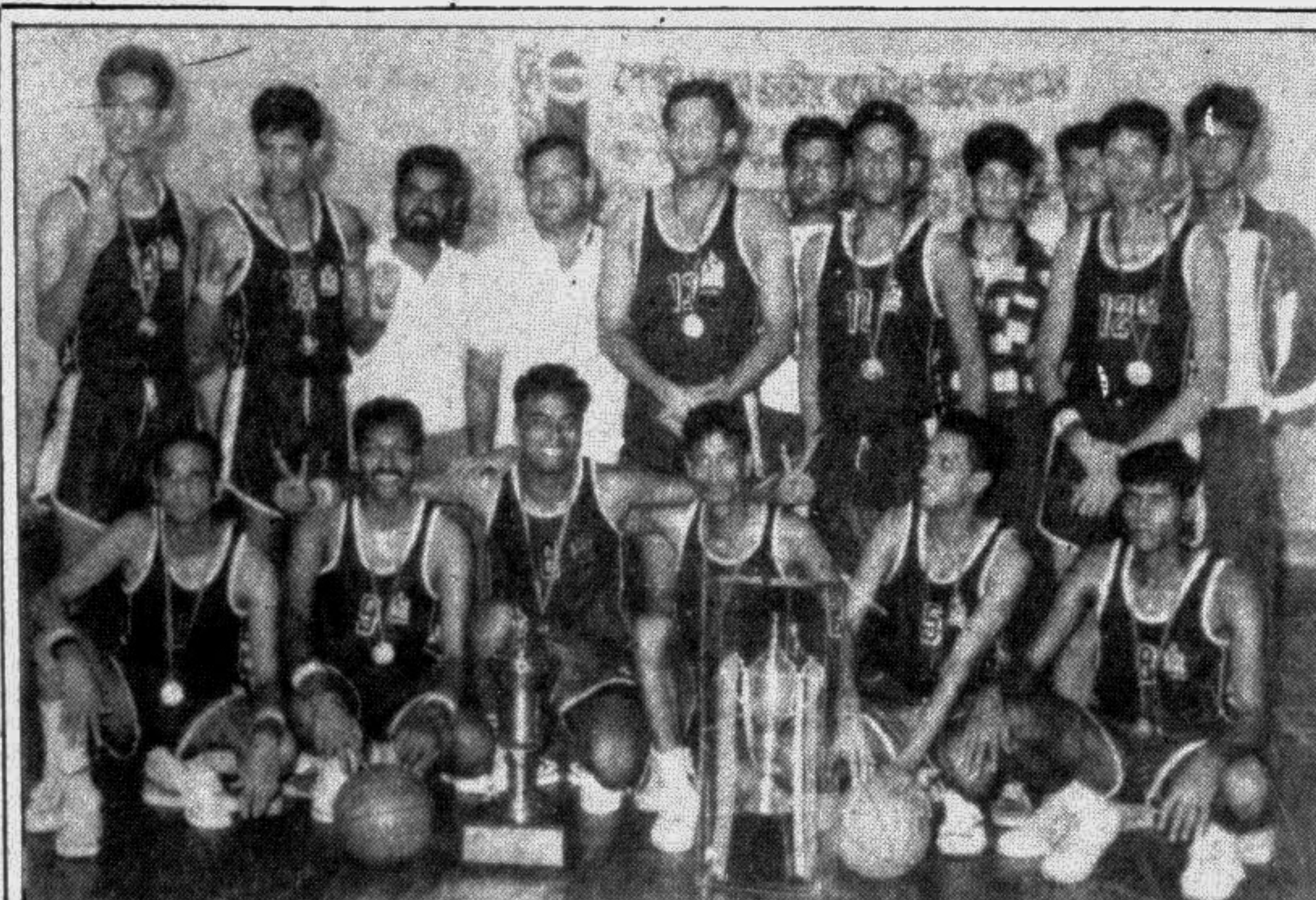
The players and officials of the Bangladesh Navy pose with the Pepsi 17th national basketball championship trophy after eliminating Bangladesh Rifles 102-64 in the final at the NSC wooden floor gymnasium yesterday.

Acting skipper Hanse Cronje set a glowing example with a century, hitting 13 fours and two sixes in a 214-minute 108, while Peter Kirsten and Jonty Rhodes added half-centuries. Cronje shared in partnerships of 68 with Andrew Hudson, 53 with Daryl Cullinan and 93 with Kirsten.