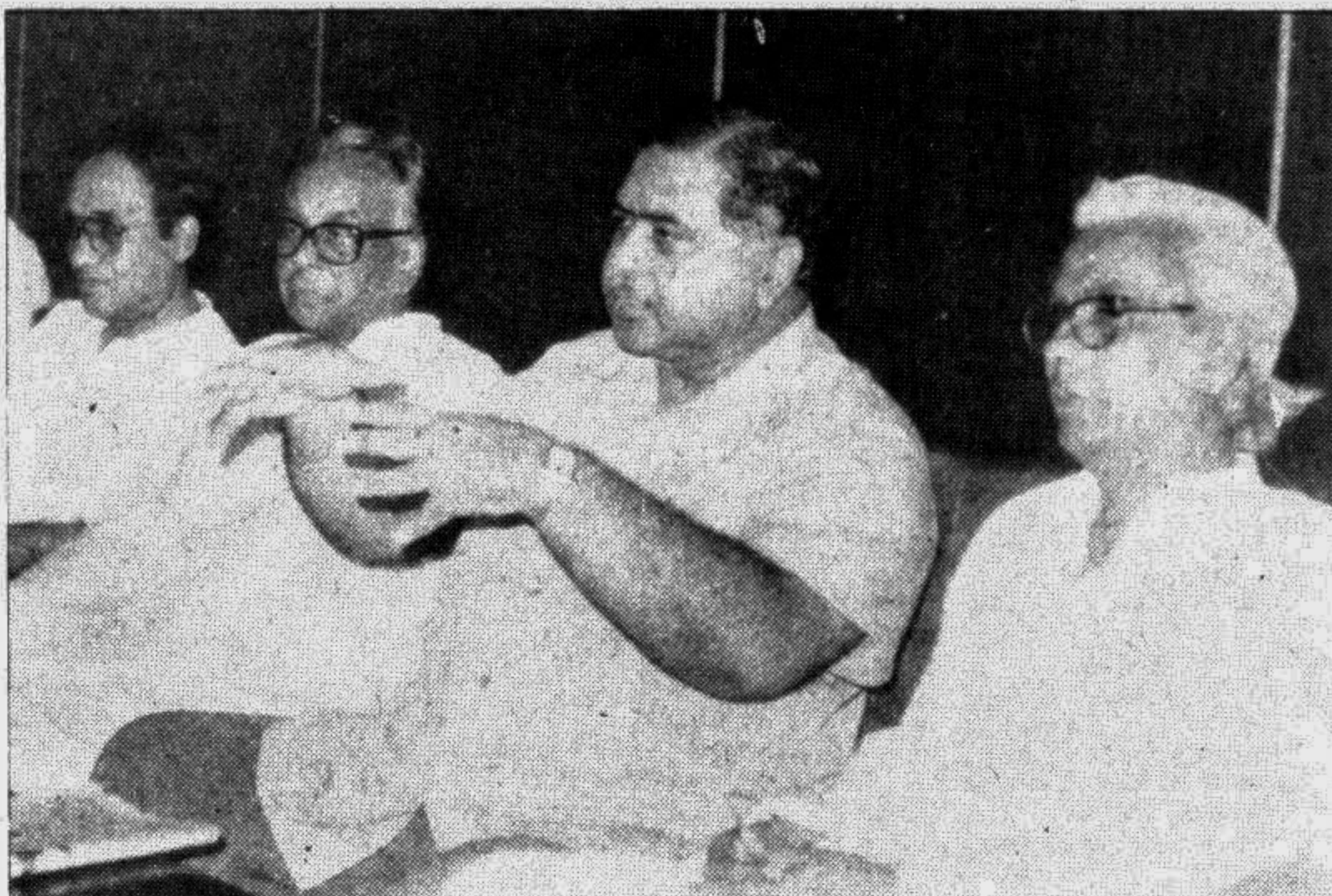
Gano Forum leader Dr Kamal Hossain addressing a press conference at the Jatiya Press Club in the city yesterday.

These are some of the few idiosyncrasies that have evolved over time in Dhaka's cars. One may begin to wonder whether this is a reflection of growing insanity among their owners. Or perhaps it is just a passing phase.