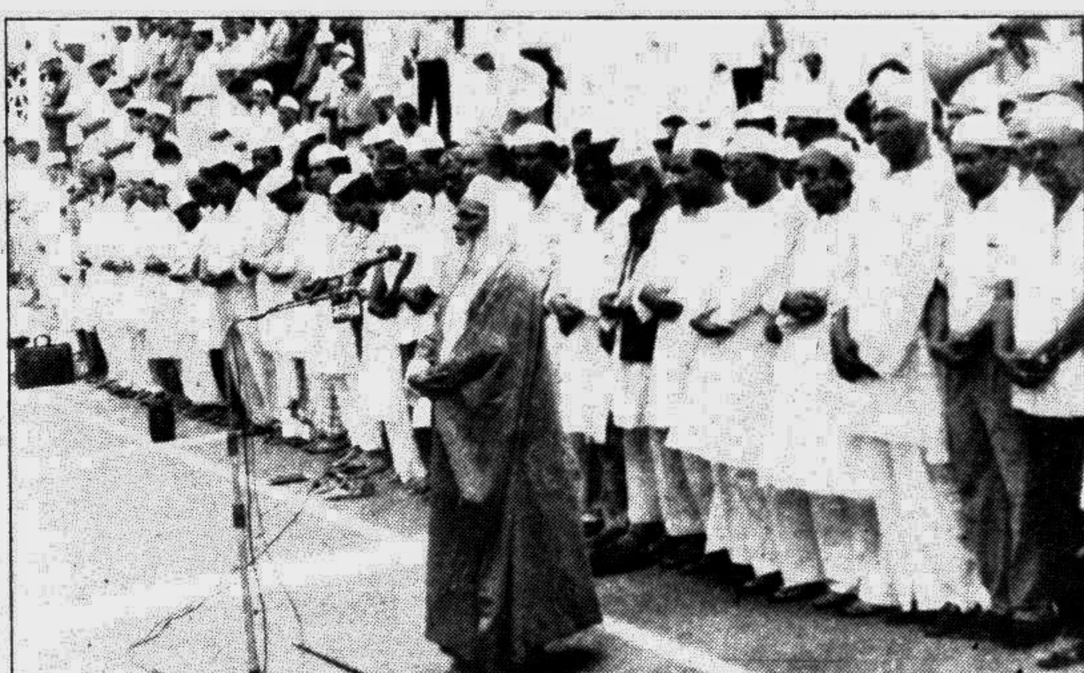
The Awami League yesterday held a gaebana janaza at the South Gate of the Baitul Mukarram for those killed in Chittagong on Tuesday.