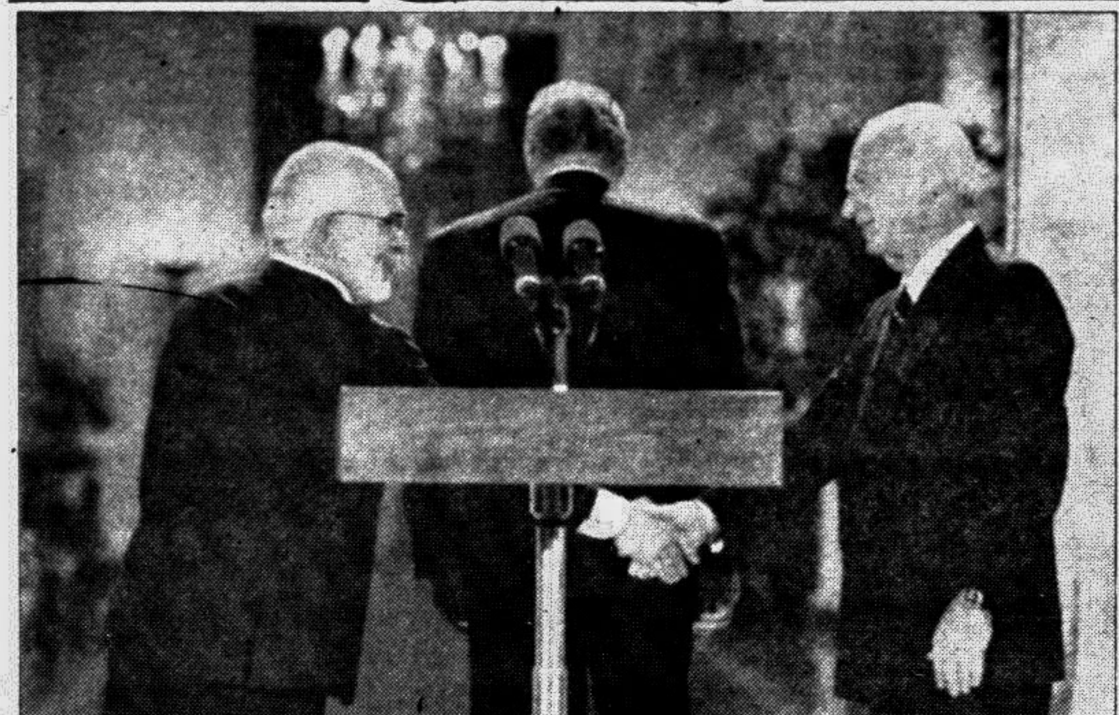
As US President Bill Clinton (C) turns and starts to leave the East Room of the White House, Jordan's King Hussein (L) and Israeli Prime Minister Yitzhak Rabin (R) shake hands at the end of their joint press conference Tuesday.

LONDON, July 27: Ethnic violence in north-western Burundi, which has the same racial mix of Hutus and Tutsis as neighbouring Rwanda, has claimed nearly 200 lives and triggered an exodus, a local official said, reports AFP. The administrator for Mbuve district in Muramvya province said he had fled his offices in Mbuve commune to his home, six kilometres away, according to a Burundian radio report monitored here by the BBC.