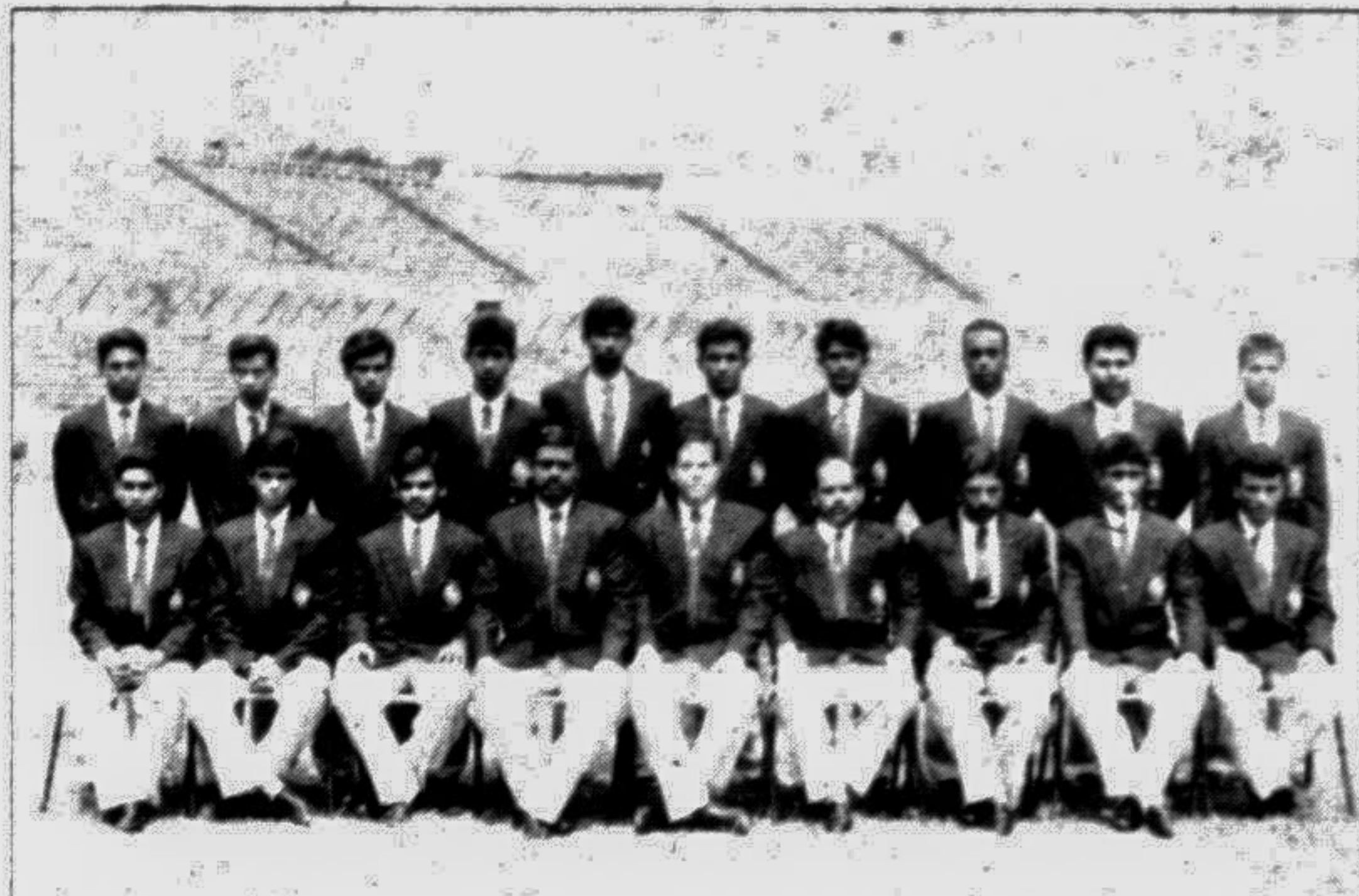
The players and officials of the 19-member Bangladesh cricket team which leaves Dhaka for Kuala Lumpur today to take part in the seven-nation international youth under-19 cricket tournament scheduled to begin in Malaysia from July 30.

While West Indian Brian Lara undoubtedly gave Warwickshire their early-season impetus he again proved no more than a bit-part performer on Tuesday as has been the case in most matches in the past few weeks.