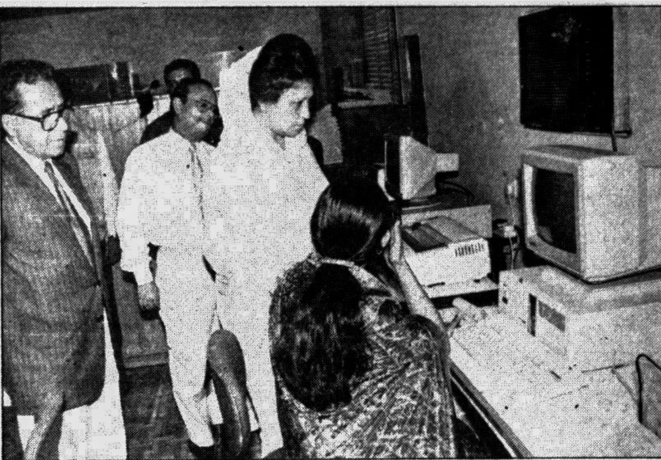
Prime Minister Begum Khaleida Zia visited the Public Administration Computer Centre at the Bangladesh Secretariat yesterday.

No arrest was made in connection with the murder, Dhanmondi police said.