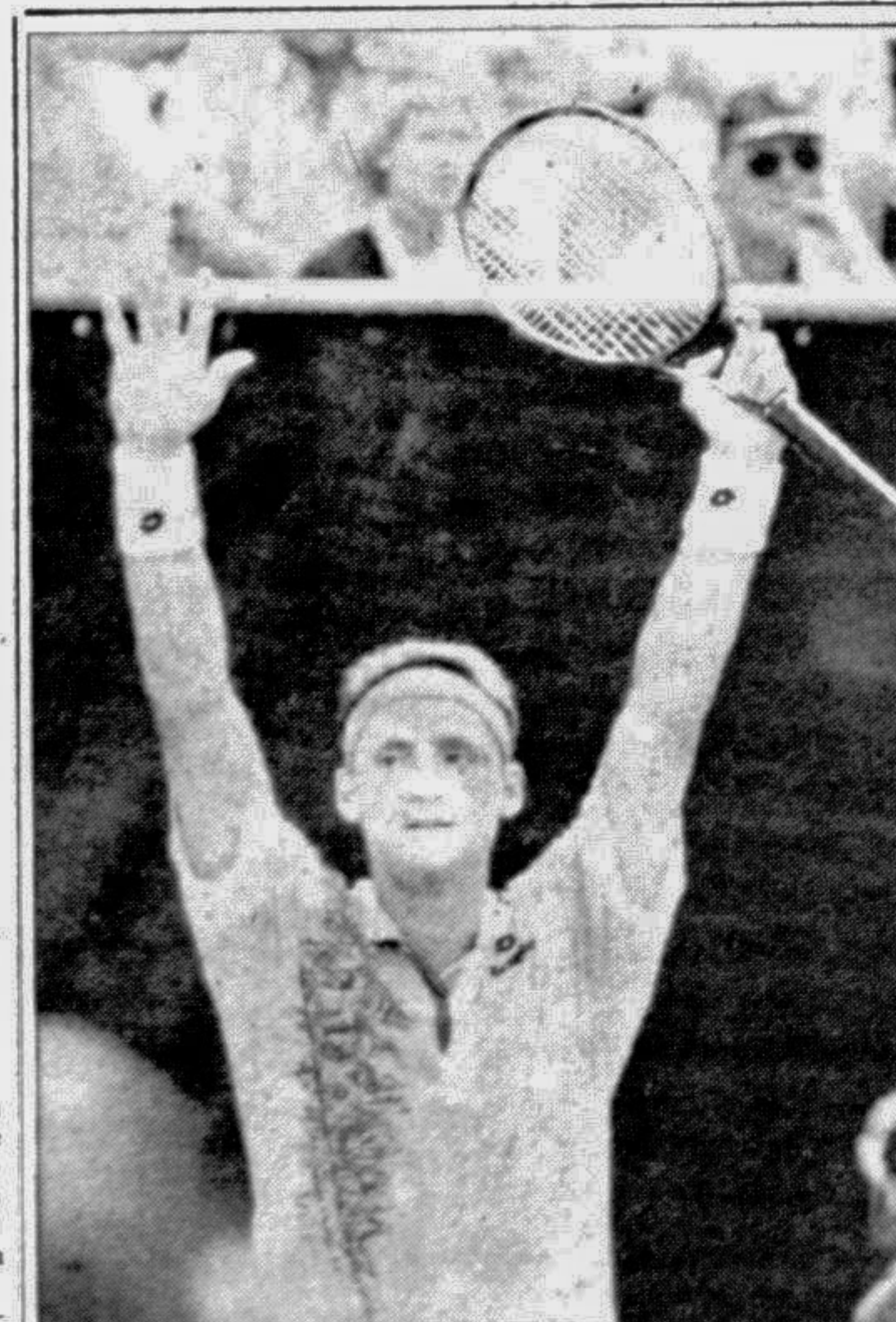
Italian Andrea Gaudenzi exults after winning his semifinal match of the international Weissenhof tennis tournament against Russian Andrei Chesnokov in Stuttgart on July 23. Gaudenzi won 6-4, 6-7, 6-3.