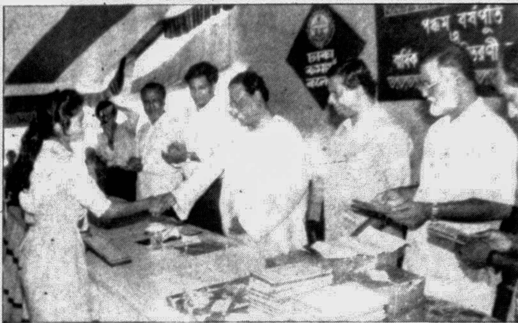
Minister for Works Rafiqul Islam Mia distributing prizes among the students of the Dhaka Commerce College on the occasion of its fifth founding anniversary in the city's Mirpur area yesterday.

The Bangladesh Fisheries Development Corporation (BFDC) earned Taka 32 lakh as net profit this year after continuous loss over last eight years, reports BSS.